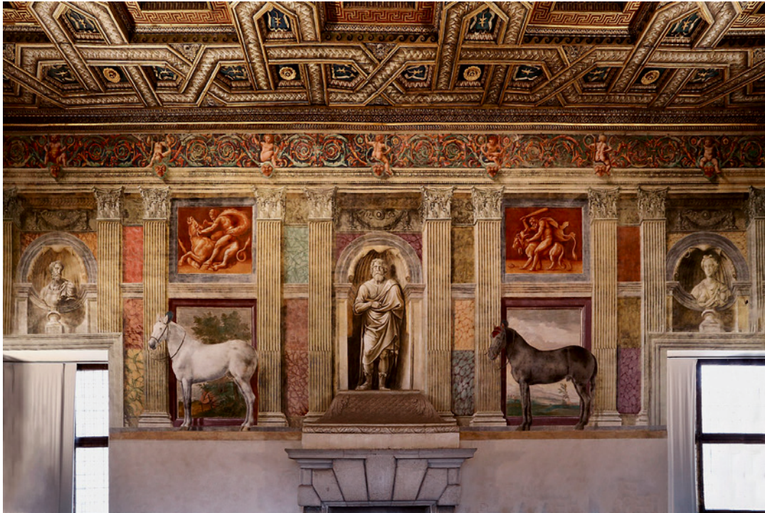
3. Giulio Romano, Hall of Horses (Mantua, Palazzo Te).

of the Madonna delle Grazie, on the shores of Lago Superiore, about ten kilometres from the city and reachable by boat (Fig. 4).