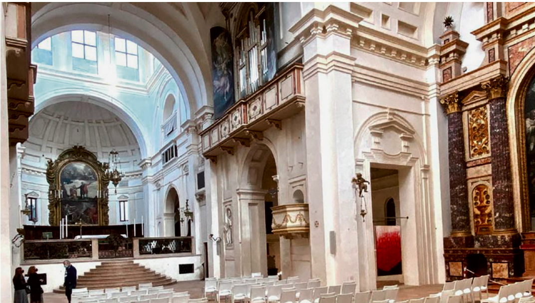
6. Mantua, Basilica Palatina of Santa Barbara, interior.