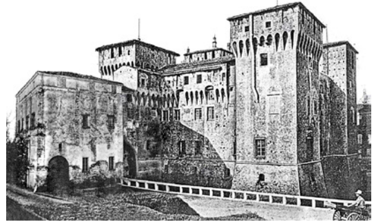
2. Mantua, Palazzina della Paleologa, now demolished.

Benedetto monastery Ladislas was received by Vincenzo Gonzaga and his cortège. In Mantua, Ferdinando Gonzaga's natural son Giacinto went out to meet the prince. The visit took place between 27 February and 2 March. 47 All sources agree on the length of the visit—three whole days, including three evenings, with a departure on the following day. 48