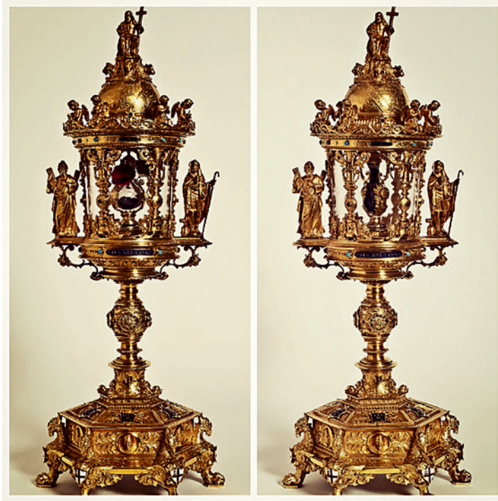
5. Mantua, The Basilica of Sant'Andrea, reliquary of the blood of Christ (Sacred vessels).