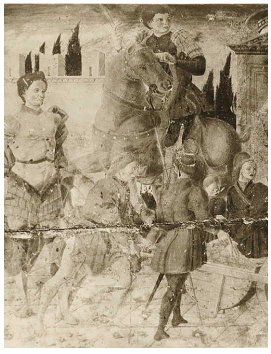
11. Marco Zoppo, The Stoning of the Elders, c. 1470, detail, whereabouts unknown, formerly London, Forbes Collection and Florence, Bellini Gallery.