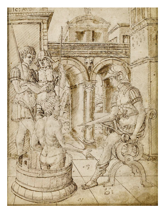
10. Marco Zoppo, The Death of Seneca, c. 1470, London, The British Museum, Album Rosebery, f. XXIIIr.