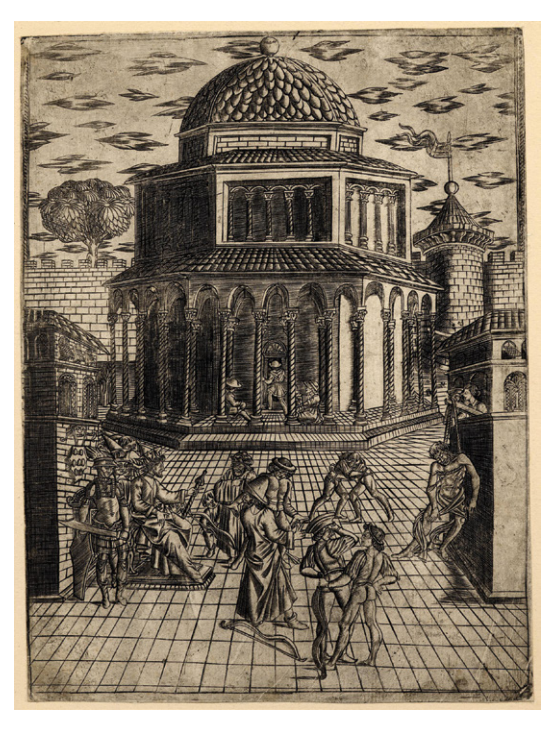
8. Master of the Putti, The Story of the Dead King and his Sons , 1471, New York, The Morgan Library & Museum, Purchased in 1929.