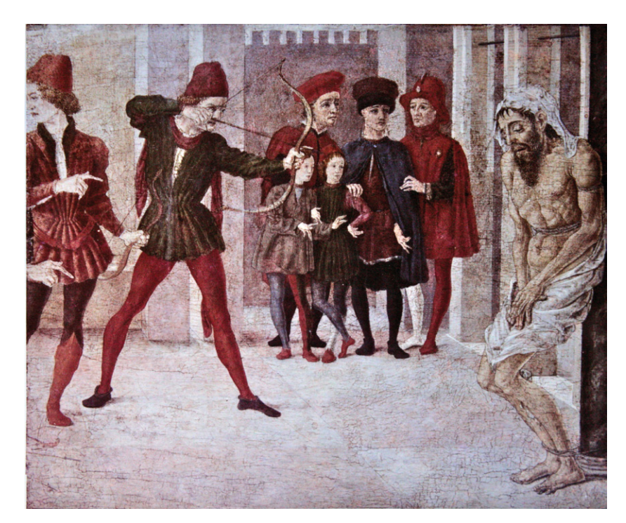
7. Marco Zoppo, Shooting at Father's Corpse: The Dead Father, c. 1470, whereabouts unknown, formerly Genoa, private collection.