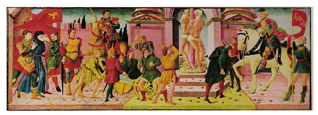
4. Marco Zoppo, The Stoning of the Elders, c. 1470, whereabouts unknown, formerly London, Forbes Collection and Florence, Bellini Gallery. Repr after: Galleria «Luigi Bellini» di Giuseppe e Mario Bellini, Firenze , Florence [1966]