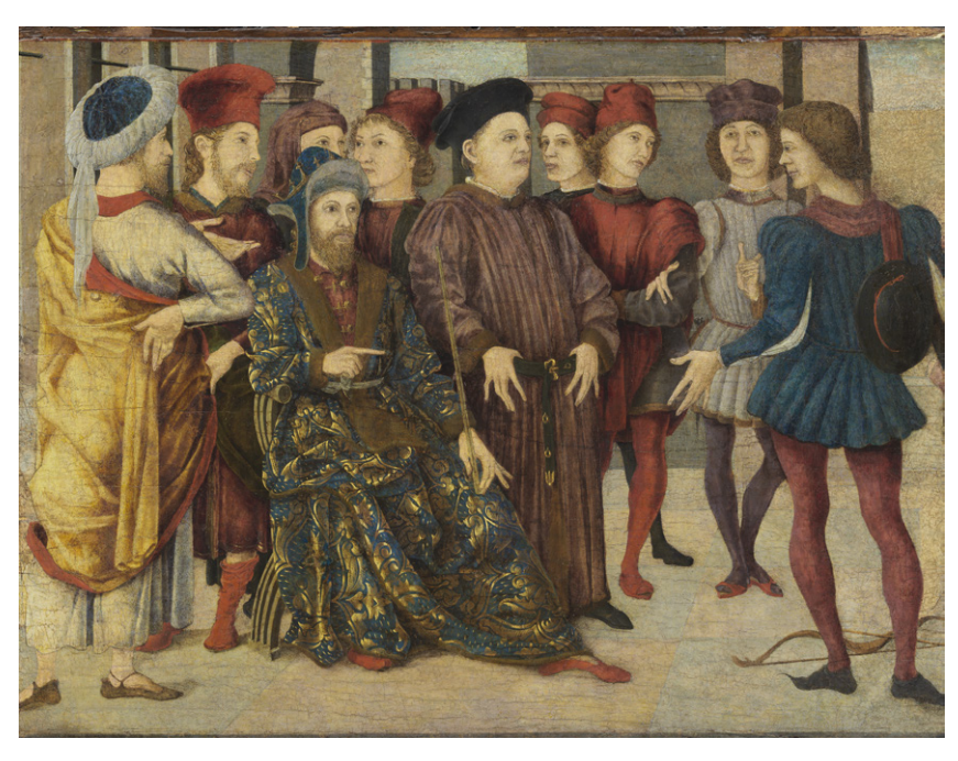
6. Marco Zoppo, Shooting at Father's Corpse: Scene of Judgement, c. 1470, Los Angeles County Museum of Art.