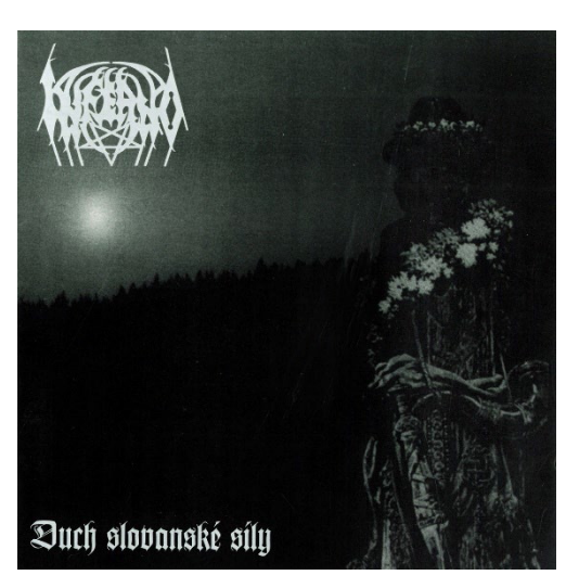
Image no. 1. Cover of Inferno's debut album Duch Slovanské síly [ Spirit of Slavic Power ] (2001). Note the interplay of the dark black metal aesthetic with the folk-romantic motif.

Probably the most important force in the first generation of Czech pagan black metal is the band Inferno from Karviná in the northeast part of the Czech Republic. Active since 1996, in its early days Inferno mainly released demos that sounded like bands from the Scandinavian black metal scene (Votruba 2016: 56-58). Inferno is importantly associated with the second wave of black metal broadly characterized by a distinctive DIY aesthetic that came about in response to the producer-dominated hair metal of the 1980s. Black metal bands of this period deliberately recorded their work with low sound quality and disseminated it via cassette tapes (Kahn-Harris 2007). Vocals are harsh and non-melodic. Guitars are buzzy, create a wall of sound, and feature only sparse solos. Drums are intense and monotonous. Songs are usually quite long, around six or seven minutes, with a strong emphasis on creating what music critics describe as "a dark atmosphere of ancient times". The first demos featured anti-Christian and nihilist themes, which were further developed in anti-Christian, Pagan lyrics on the albums Duch slovanské síly (2001), V návratu pohanství (2003), and Nikdy nepokřtěni (2006). Such an aesthetic intentionally contrasts with the classic flashy heavy metal sound with intense vocals and virtuoso guitar solos.