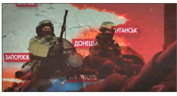
Il. 4. The Column film frames (TSN). The image of hostile attack on Ukraine

Aggressive methods of social myth formation (information war) in Russia aimed, first of all, at artificial production of an image of enemy of Ukraine and Ukrainians, is based to a large extent on a tradition of cosmogonic myth describing a fight between the forces of light and darkness, chaos and space. Showing the Ukrainian as an enemy-nationalist (Nazi) and Ukraine as a "residence of evil", the information war started by the Russian Federation on the other side of dichotomy of good and evil formed a need of "legal"