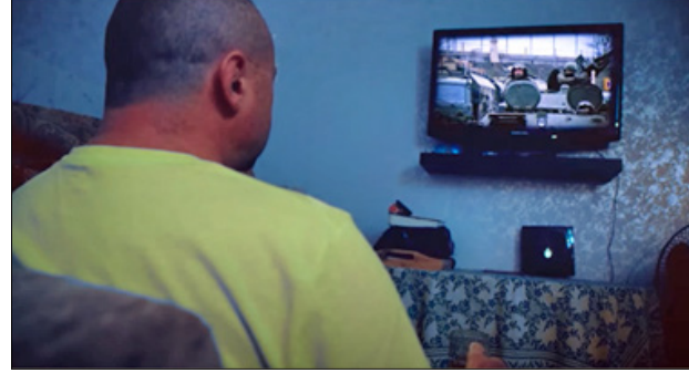
Il. 6. The Column . A Russian viewer watching TV

invasion of Donbas. It provides many facts attacking the Russian propaganda narrative about their non-presence in Donbas, civil war and the land being bombarded by Ukrainian troops (the motive of the current narrative of a "special military operation" and Russian revenge for Donbas). The film states that residents of Donbas are hostages of Putin's policy.