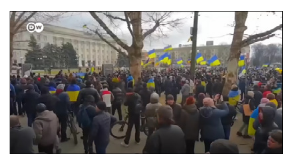
Il. 1. A frame from the film War on Ukraine – Life in Kherson (DW). Meeting in Kherson against occupation. Resistance to the Russian troops