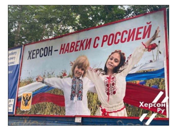
Il. 3. Billboard in Kherson using the images of Ukrainian children.

Thus, the temporal aggressiveness of the hostile narrative is opposed to those images of time which are being actualized in the narra-