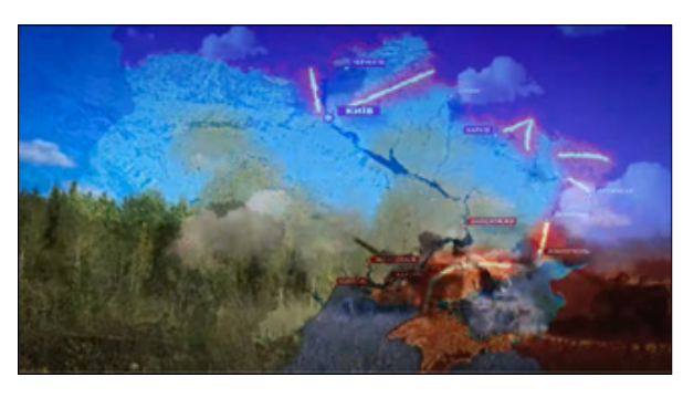
Il. 5. The Column film frames (TSN). The image of hostile attack on Ukraine