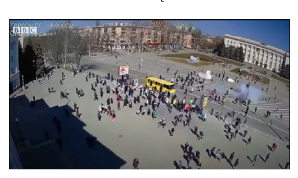
Il. 2. Frame from the film Occupied (BBC), Dmytro Bahnenko. Dispersal of an anti-Russian meeting in Kherson. March 2022

One of the peculiarities of the narrative dimensions during the period of invasion in 2022 is temporal. Particularly, in the narrative of a common person's life, a temporal gap is accentuated – the time of