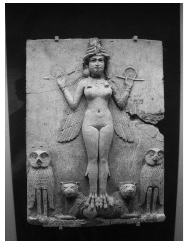
Photo 4: Queen of the Night, probably Ereshkigal – Sumerian goddess of the Underworld (British Museum, London), Photo – Ł. Byrski

to the gods when life will end, 4) life itself is a great journey of the soul.<sup>61</sup> The word for soul is not known for Luwian and possibly it is represented in hieroglyphs by logogram thought to represent the "vase" before but now is known to be "heart" instead.<sup>62</sup>