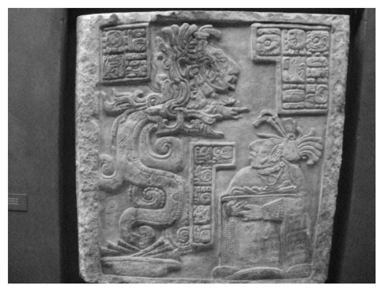
Photo 3: Yaxchilan, Lintel 15 – Lady Wak Tuun of the Ik' polity – wife of Bird Jaguar IV invoking the Vision Serpent in a bloodletting rite (British Museum, London)