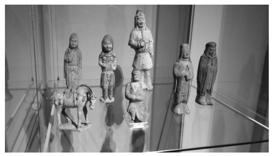
Photo 2: Chinese grave figures of soldiers, Sui and Tang dynasty 581-907 C.E. (Narodni Museum – Naprstkovo muzeum asijskych, africkych a americkych kultur, Prague)