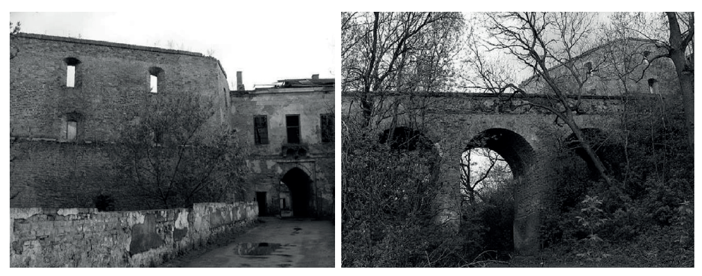
Fig. 2. Klevan Castle. Current status. View from the entry bridge.

The function of the castle had changed many times during its existence. After the loss of the original defensive function, almost for a century and a half, up to 1773 [14], it contained Jesuit missionaries, and it was used as a Jesuit board. The castle had a county school, gymnasium, military hospital, spiritual school, children's colony, and boarding school. Its final function was medical and labour prevention. This use devalued its historical, cultural, and architectural value, however it somehow allowed to maintain physical existence and prevented its total destruction.