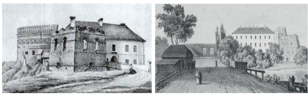
Fig. 1. Klevan Castle.Iconography [12, 13]