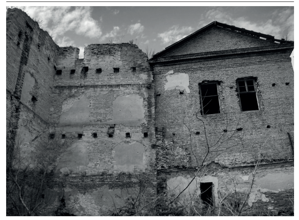
Fig. 4. Klevan Castle.Current status. View of the inside of the west tower.

Two options for returning the degraded architectural monument to active physical and social life were considered. The first proposed transformation is the introduction of the process of conservation and museification. In this case, the destroyed castle would become a museum exhibit and the area around it would be merged into the city park. This will increase its historical and social value by giving the castle a new function and transforming it into the city's green recreational area. However, the preservation of the monument in its existing form and its museification alone will not increase its architectural value. Therefore, first of all, a more active and modern use of the object should be proposed. It will provide a functional content and diversity with would interest different parts of the society, and thus ensure the renewal of its socio-economic value. Secondly, abandoned parts of the degraded castle would be restored and recreated to enhance its architectural value.