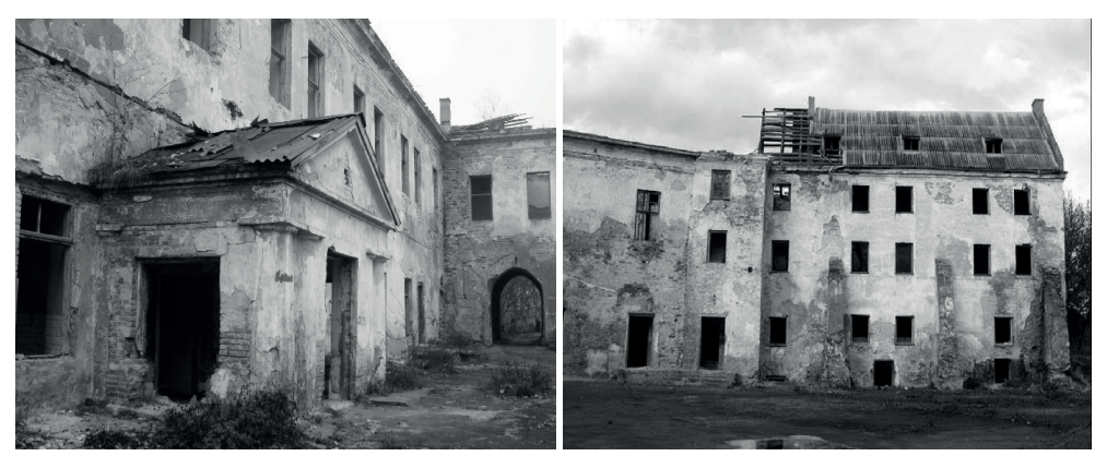
Fig. 3. Klevan Castle. Current status. View from the courtyard.

The castle has not been used since the late 20th century. Just like 200 years ago, during the first long period of the abandonment, it went into a coplete decay (Fig. 3, 4).