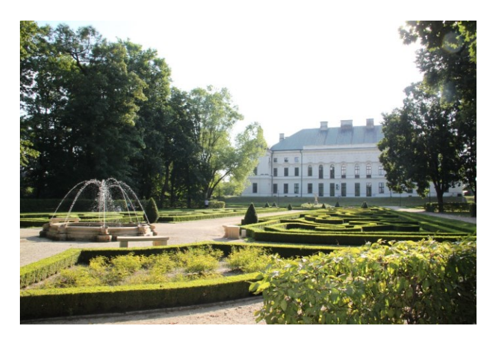
Fig. 2. Park in Lubartów, current state

Currently, the city of Lubartów is one of the five municipalities involved in the partnership project called "Zielony LOF" (the Green Lublin Functional Area). This project is co-financed by the European Regional Development Fund as a part of the Regional Operational Program of the Lublin Voivodeship for the period of 2014-2020. The project is focused on increasing the biodiversity of the covered areas by improving the quality of green areas along with their management and limiting the impact on the areas. One of the tasks of the project is "modernization of the municipal park and supplementing the infrastructure to enhance tourist attractiveness of Lubartów" . Within the framework of this mission, the arrangement of the entire park, included the introduction of new functions (areas of activity for children and adults) together with the necessary infrastructure, pond cleaning and adaptations [20].