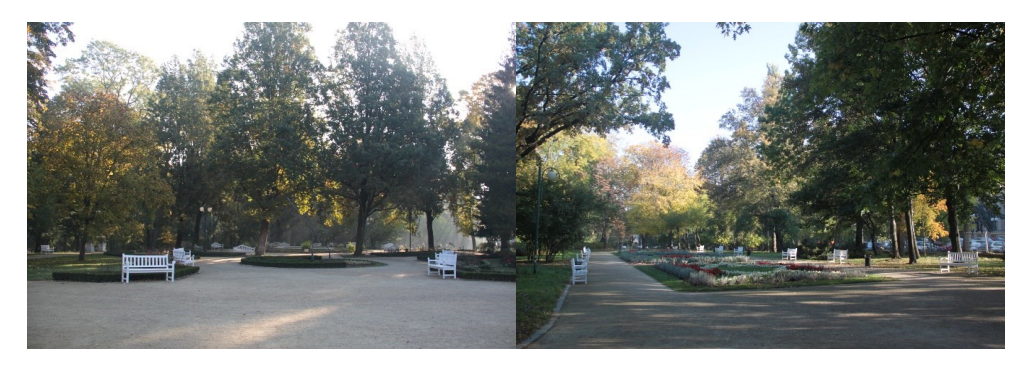
Fig. 6. The Saski Garden in Lublin, current state

At the end of the 1950s, there were plans to locate the palm house in the Saski Garden. The opinion of an expert was commissioned for the needs of the local plan " in which basic requirements were defined and the significance of this type of garden architecture was characterized as: educational, didactic and tourist ". Therefore, the study underlines that this type of facility should be located in municipal parks, and the most representative and well located in terms of communication was the oldest municipal park of Lublin called the Saski Garden (Ogród Saski). The area devoted for the construction of a new building was a rectangular, flat square created after repurposing of an agricultural farm. It bordered on two sides with the old-growth trees of the municipal garden, and on the other side with the building formerly called the House of Party, currently housing the Rector's Office of the Medical University. Placing of such an important architectural building necessitated the plans to change the main entrance to the park, whereas the palm house was to "stand on the background of the old-growth trees of the park as far as possible from Racławicka street, and the entire flat area was to be transformed into a representative flower garden, separated from the street with a belt of trees and bushes" (Fig. 6) [24].