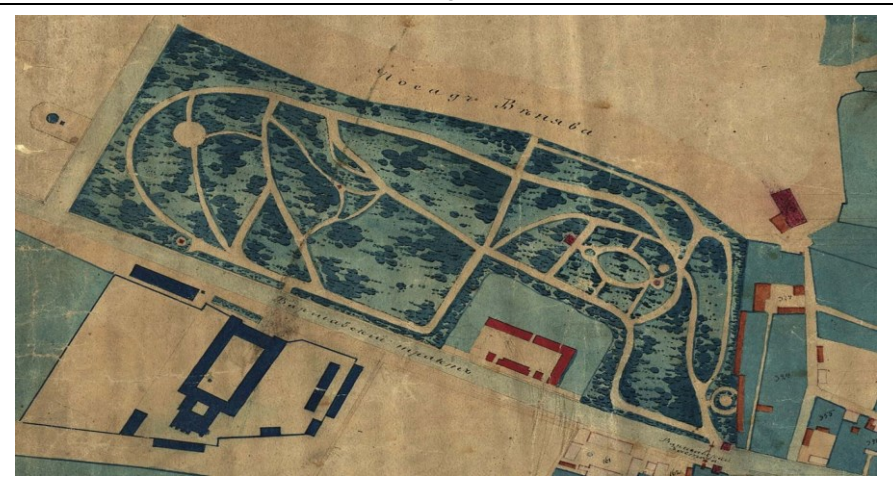
Fig. 5. Archival plans of the Saski Garden in Lublin, fragment План города Люблина 1870, source: State Archives, s. 5, План города Люблина, 1870, Piotr Cegliński, Lubelskie Archiwum Cyfrowe