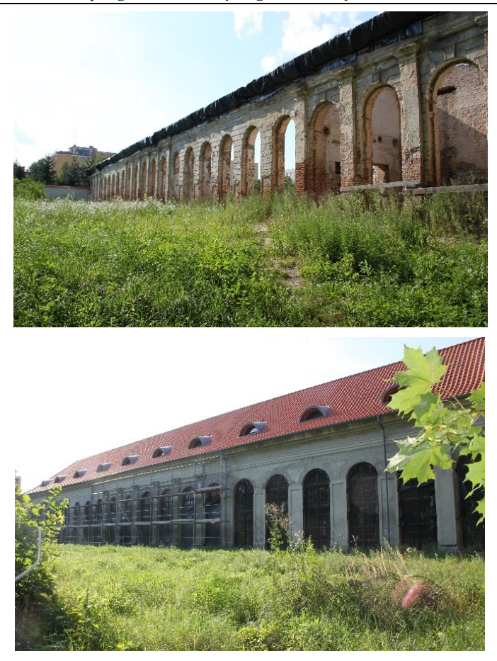
Fig. 4. The hothouse in Lubartów in 2005 and 2018