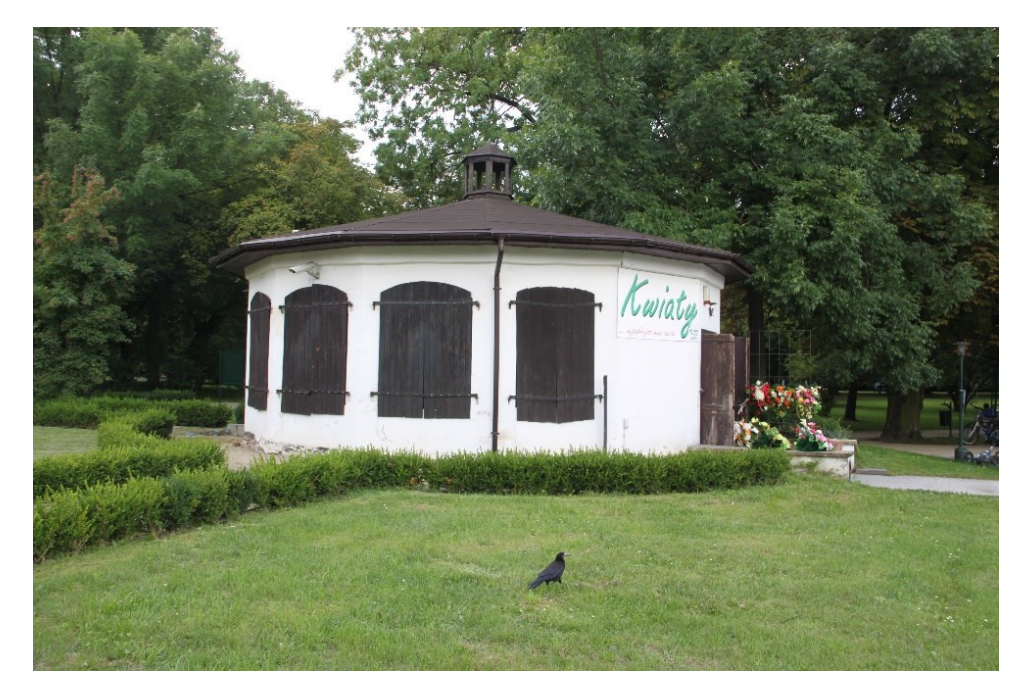
Fig. 9. The building of the former greenhouse and now the florist's shop, current state

The building of the former greenhouse is currently used for a florist's shop. It was built in the 1930s and was based on the modest greenhouses accompanying manor gardens. The building built on the circular plan is in the form of a rotunda with the vestibule in front of the entrance. The building had a surface of 290 m<sup>2</sup> and its height was four meters. The building material and cast iron windows arranged symmetrically in the facade were obtained from the demolition of the "Unia" factory located at Lwowska street. There was a chimney in the central part of the greenhouse. Smoke channel in the external walls was used to heat the greenhouse [5] (Fig. 9).