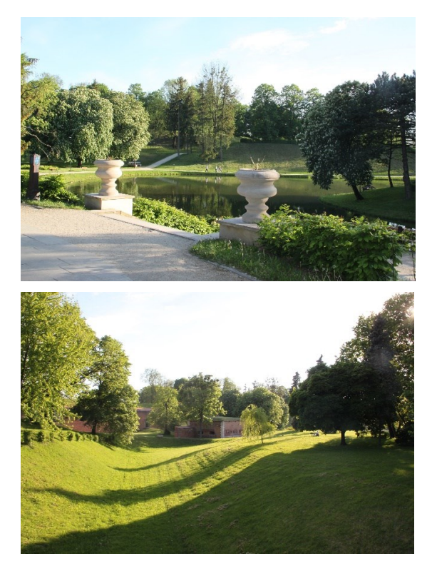
Fig. 8. The municipal park in Zamość, current state

Fig. 7. Schematic plan of park in Zamość, author's own elaboration on the basis of the photo in archive of Instytut Sztuki PAN in Warsaw, nr 18373 (1927)