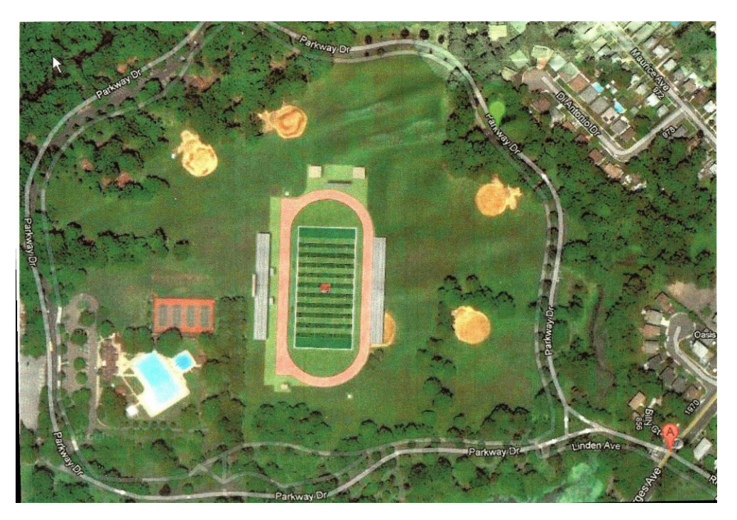
Fig. 2. Rahway River Park as seen from above.

Rahway River Park in Union County, NJ, USA (Fig. 2) was chosen as a case study to demonstrate the way of using the universal standard. This park is well-documented in the history of landscape design and well-known internationally, as it was designed by the Olmsted brothers. Firstly, this place was recommended to the author by regular parkgoers who described it as a good place to disengage from the problems of everyday life. One of them described this experience: "After one hour spent in the park, the weariness of the daywork in front of the computer disappears. I come back home from this park with new energy." The research question was what makes this park a health-promoting place in terms of the architectural and landscape design? (Fig. 2-10).