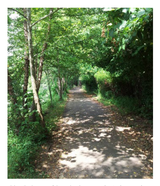
Fig. 10. Rahway River Park - one of the paths.