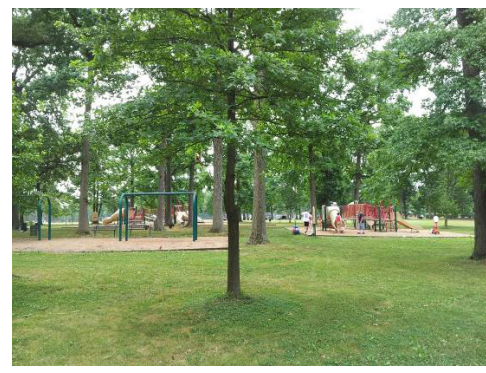
Fig. 5. Rahway River Park – one of the smaller exercise areas.