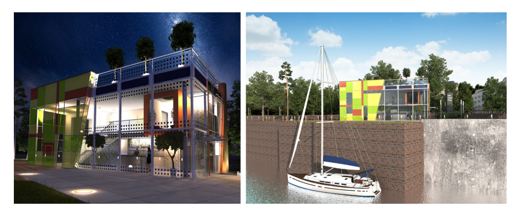
Fig. 1. "Solar-copper house" in Wrocław (concept): solar facade with PV modules of various colors and translucency.

The design of the PV facade, created largely by the aesthetic factor and constituting a kind of "showpiece" of the building, did not provide sufficient energy gains, as expected in line with a plus energy building concept. The implementation of this aesthetic goal forced the introduction of the aforementioned spatial and architectural solutions (passive systems) and other installation solutions (including a heat pump) in combination with energy-saving technical and construction solutions. One of the features of the building is its high thermal insulation properties of the remaining external walls combined with a radical reduction in the share of glazing, especially in the northern elevation. This influenced a simplified aesthetic vision of these walls, which emphasized the leading importance of the described southern facade as a solar facade.