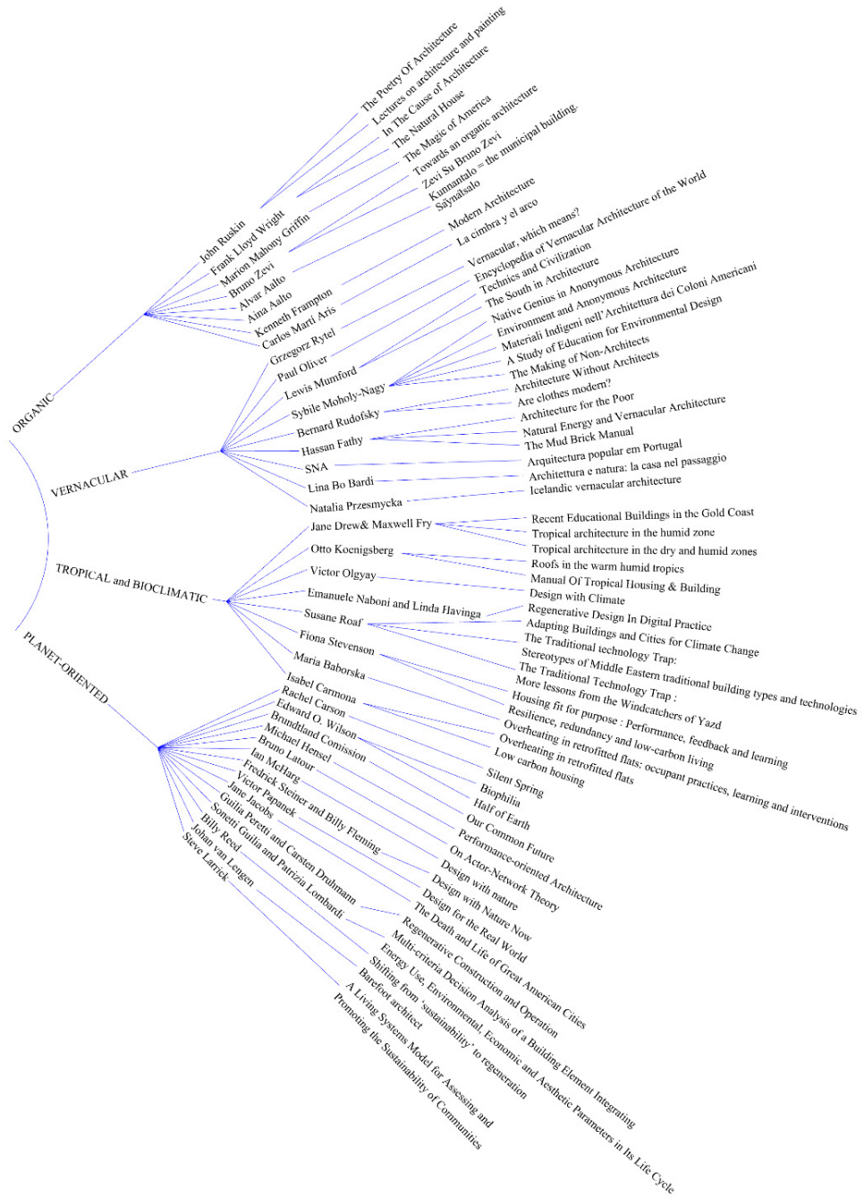
Fig. 1. Many beginnings: the thought, thinkers and actions behind the planet-oriented architecture – diagram