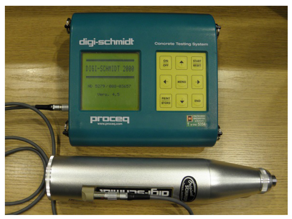
Fig. 1. Digital Schmidt hammer [10]

The second method of non-destructive testing is the sclerometric method, also known as the hardness test. Hardness is the resistance of the tested material to deformation caused by concentrated forces. It is most often measured with sclerometers, the so-called Schmidt hammers (Fig. 1) with different impact energies for specific applications.