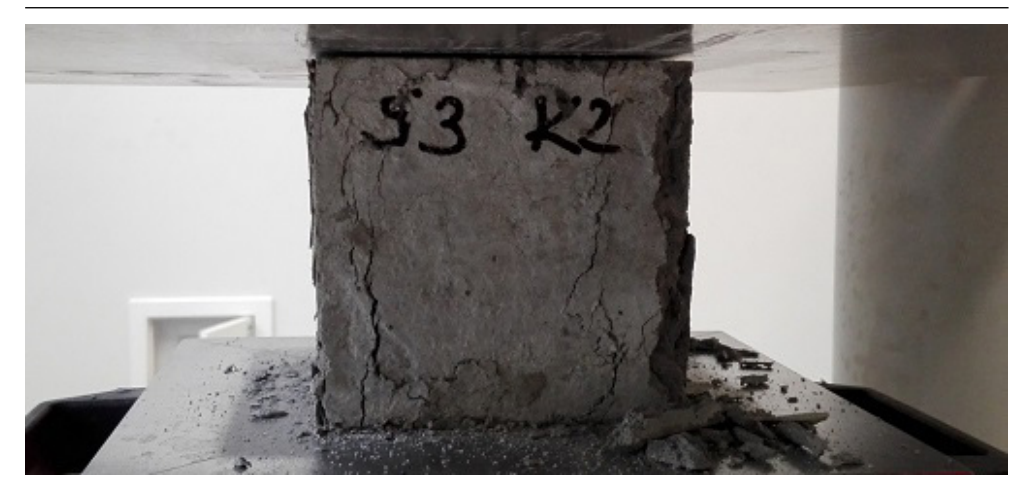
Fig. 3. Concrete specimen after compression test