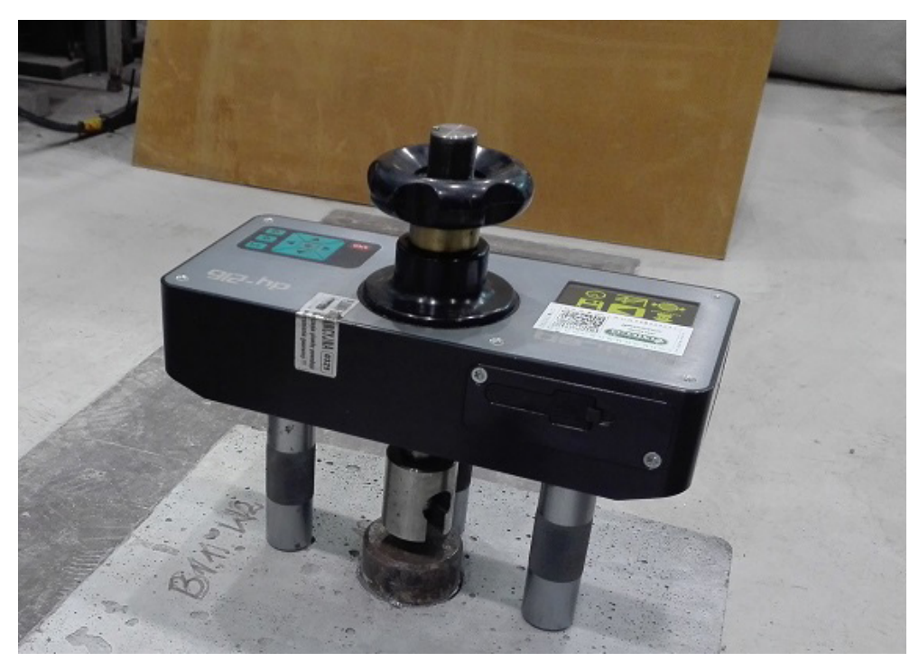
Fig. 2. A device used in the pull-off method

Destructive tests involve extracting witness samples from the existing structure and destroying them for strength characterisation. The axial compression test is applied for estimating the compressive strength of concrete. This method is based on the measurement of force needed to destroy the axially compressed sample, with the use of the strength testing machine in the research laboratory. Witness samples are extracted by coring or cast in separate moulds during the manufacture of concrete components. The cores used in the testing should be extracted from the areas which will not weaken the structure, that is, away from joints, edges, and main reinforcement.