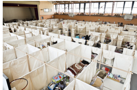
Fig. 2. Emergency shelter with partitioning.

In response to this issue, Shigeru Ban has been working on a partition system using paper tubes and clothes since the early 2000s. This system, called “Paper Partition System” is light, flexible, and does not need any fixation, making it easy to assemble and disassemble.