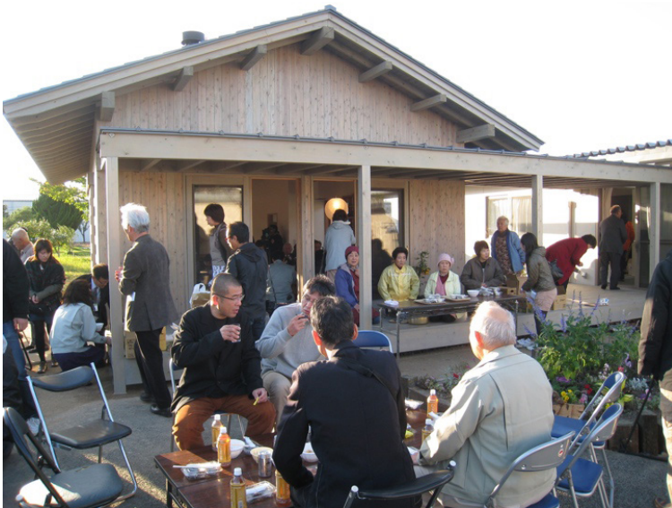
Fig. 3. Sendai “Home-for-all”. Source: [17]

Scattered communities and cramped living conditions do not enhance social cohesion in temporary housing complexes. In response to this issue, Toyo Ito and his colleagues of Kysin-no-Kai have created the concept of friendly places where the inhabitants could meet and share convivial moments [15]. That is the origin of the “Home-for-All” project (みんなの家 Minna no ie ), with the installation of community spaces in the kasetsu jūtaku settlements after the disaster of 2011, which later expanded to various contexts [16].