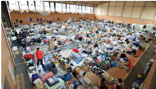
Fig. 1. Emergency shelter without partitioning.

Nevertheless, these facilities are generally wide open spaces like school gymnasiums, lacking privacy for the victims who stay there for months waiting for relocation to temporary housing (Fig. 1). The priority in this phase is to provide privacy to improve the comfort of the refugees.