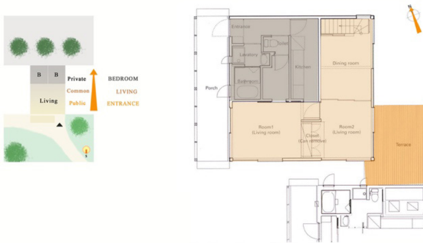
Fig. 6. Example of housing following the living access type, Source : own study

The inhabitants chose the architects for the public housing projects through a proposal competition and a public presentation. These three disaster-relief housing projects (災害公営住宅 saigai kōei jūtaku ) built in Iwanuma have then become references, regarding the short delay of construction, but also the quality of the dwellings, which are one of the first attempts to apply the concept of the “living access plan.”