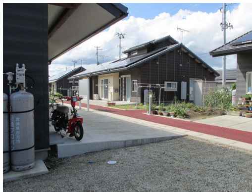
Fig. 5. Example of Fukko Jūtaku built in 2015 in Tamaura-nishi, Iwanuma City (Tōhoku)

Avoiding group members' dispersal prevents isolation and social withdrawal, which is a particularly high risk for refugees [10]. The Tamaura-nishi district (Fig. 5) has been divided into six zones, one for each village, mixing private and collective housing.