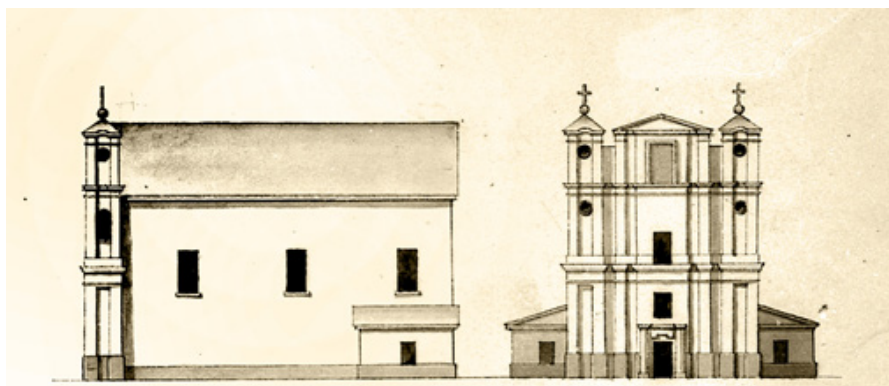
Fig. 3. “The design of the former Carmelites Monastery(...)”. Fragment 2.