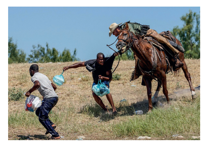
Fig. 4. A United States Border Patrol agent on horseback tries to stop a Haitian migrant from entering an encampment on the banks of the Rio Grande near the Acuna Del Rio International Bridge in Del Rio, Texas on September 19, 2021.

EL: What you just explained makes me think of Jonas Staal's essay "Propaganda (Art) Struggle" (2018) and parts of the lecture he gave at the Free University of Bozen-Bolzano. Images like caravana advance an "us vs them" narrative that allows simple dichotomies to be constructed, with the help of seemingly mono-lithic entities, and, ultimately, politically instrumentalized. Staal inverts the Chomsky-Herman propaganda model and argues for "Collectivity" versus "Anti-Communism," Communism having been instrumentalized as a dominant trigger for fear and a unifying element within the "us vs them" narrative when Manufacturing Consent was first published during the Cold War in 1988 (Herman and Chomsky). It seems now to have been replaced by Islamophobia and Anti-Migration.