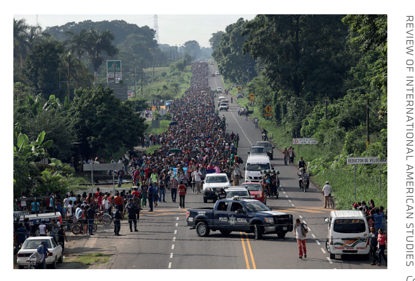
Fig. 2. A migrant caravan, which has grown into the thousands, walks into the interior of Mexico after crossing the Guatemalan border on Oct. 21, 2018, near Ciudad Hidalgo, Mexico.