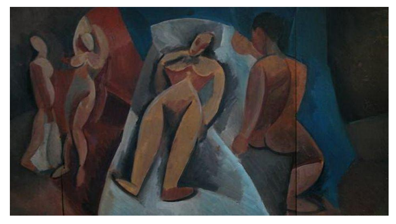
Fig. 1. Pablo Picasso, Reclining Nude with Figures , 1908 (oil on wood)

poliperspectivism can be read to present it from many different angles, reflecting all the shades of perception. Therefore, the human figure is depicted to bring forward—using representation—new orientations of its phenomenological axes; in such a perspective, the sleeping figure coincides with a total reversal of the upright posture (Fig. 1).