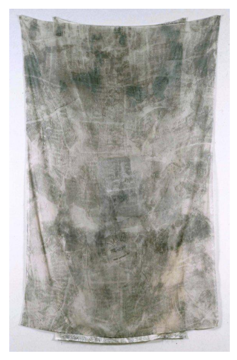
Fig. 5. Robert Rauschenberg, Hoarfrost , 1974 (solvent transfer on fabric with pillow)

The Steinbergian interpretations, respectively of Picasso's and Rauschenberg's work, present evident analogies, as if Picassian "peinture conceptuelle" were a precursor of the Steinbergian flatbed picture plane. It is almost as if Picasso had been the only modernist voice with the foresightedness to anticipate postmodernist developments within the conception of images as operational and informational processes. At the end of his essay on Picasso and sleep, Steinberg accords Picassian configurations the same operational power of "flat bedding" the "columnar body" (Steinberg 2002, 27), because of the mutual interaction of verticality and horizontality on the picture plane, all in favor of the latter: Picasso's "upright watchers and reclined sleepers serve him as a means of constantly charting and redefining the ground of his canvas, his paper, or etcher's plate. [...] They stake out an elemental geometry" (Steinberg 2007a, 114).