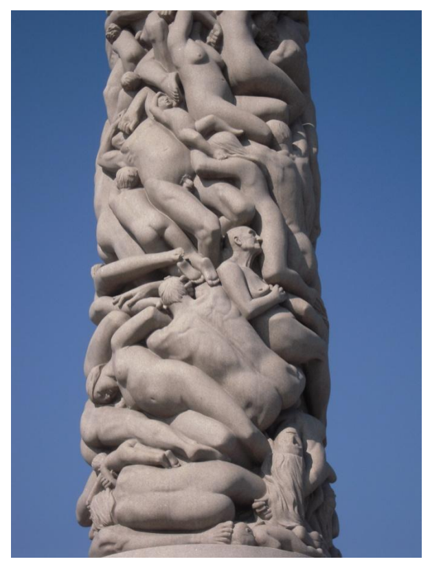
Fig. 2. Gustav Vigeland, The Monolith (detail), The Vigeland Park in Oslo.