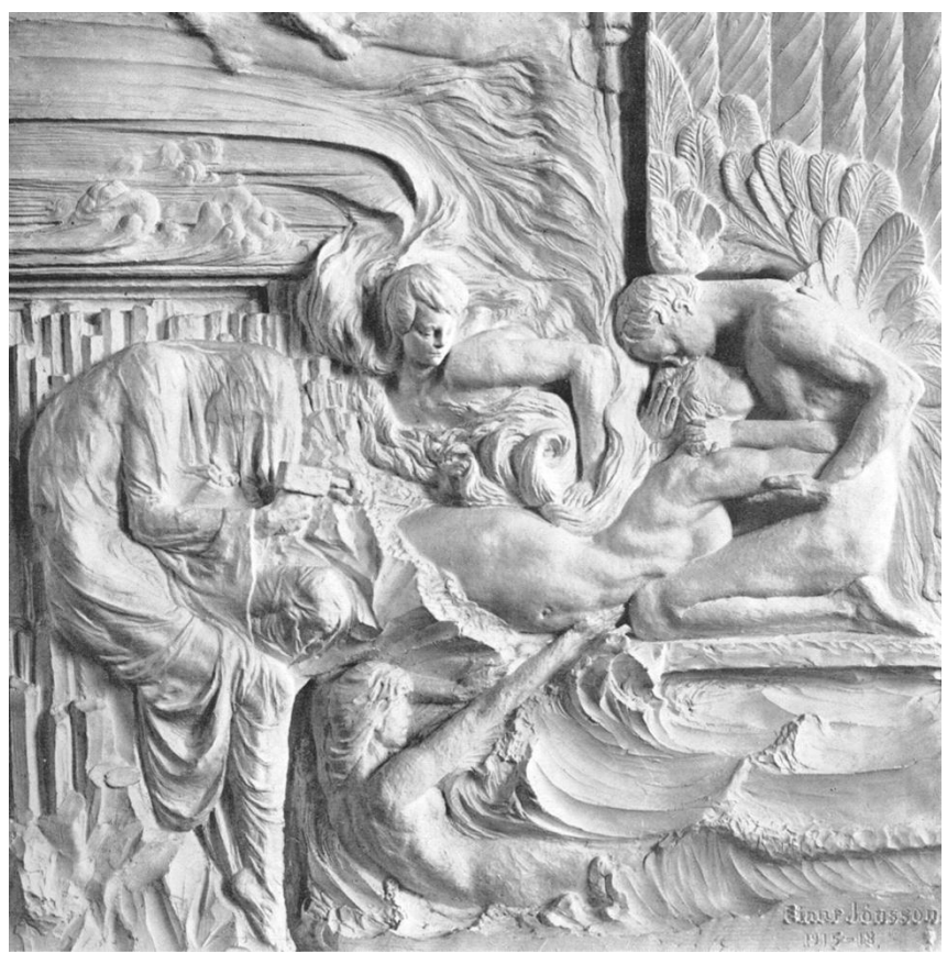
Fig. 7. Einar Jónsson, The Birth of Psyche. Courtesy Einar Jónsson Museum in Reykjavik.