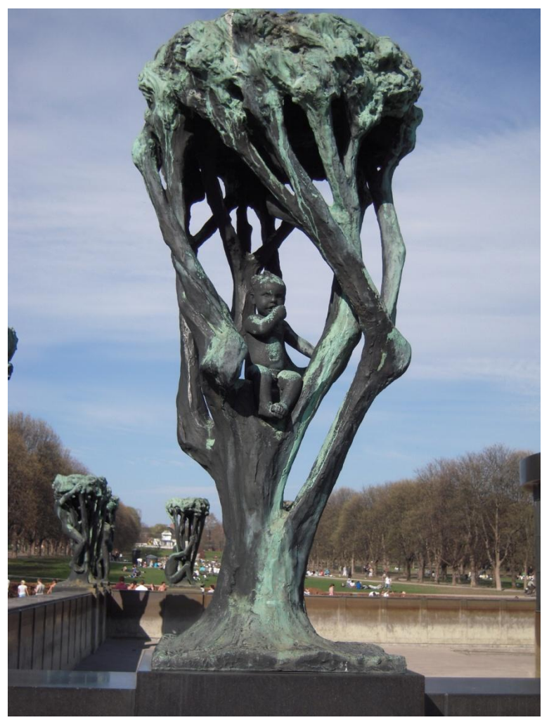
Fig. 4. Gustav Vigeland, The Vigeland Park in Oslo.