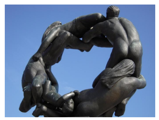
Fig. 1. Gustav Vigeland, Wheel of Life, The Vigeland Park in Oslo.