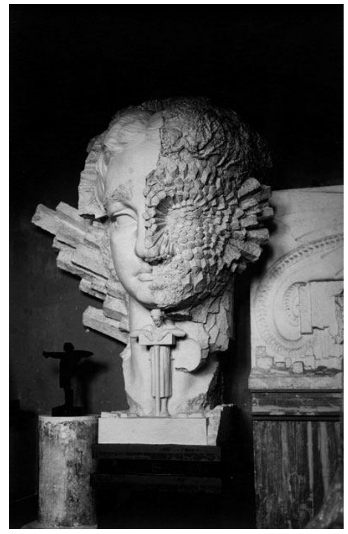
Fig. 8. Einar Jónsson, The Rest .