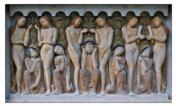
Fig. 5. Bernhard Hoetger, The Resurrection , The Plane Tree Grove in Darmstadt.