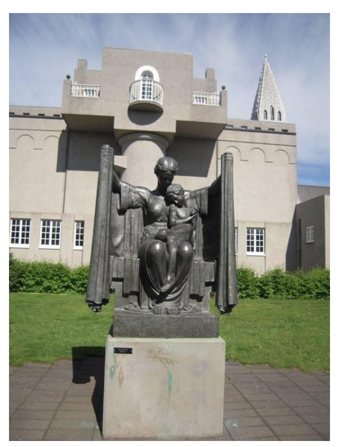
Fig. 6. Einar Jónsson Museum in Reykyavik, view from the garden.