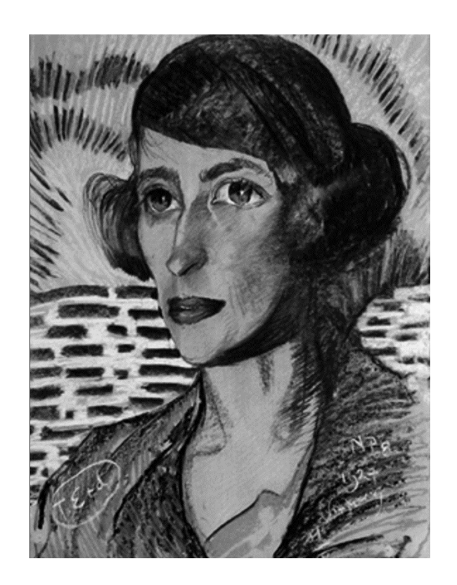
S. I. Witkiewicz: Self-Portrait as a Woman , October 11th, 1927 pastel/paper, 63 x 48 cm personal property (sold at Agra-Art Auction House in 2006)