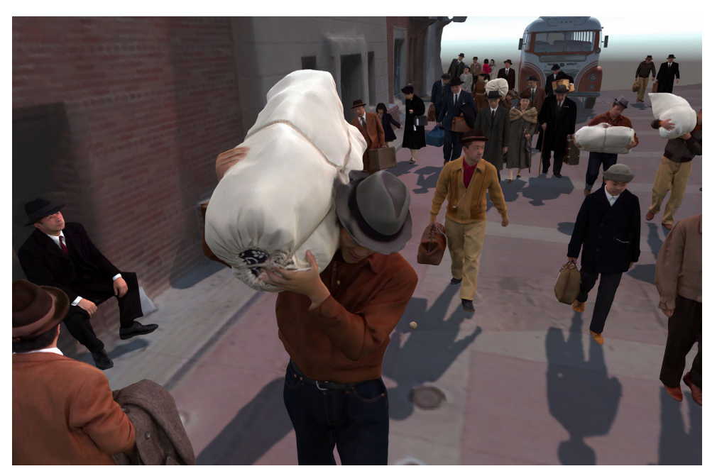
Screenshot of the Nishi Hongwaji Buddhist Temple augmented reality installation in development