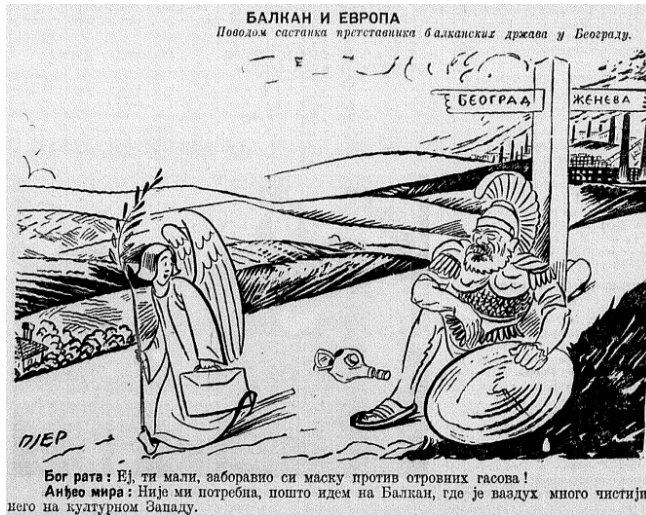
Image 1: Балкан и Европа , „Политика” 1934, бр. 9240 (4.02), р. 2, [online] http://www.digitalna.nb.rs/wb/NBS/novine/politika/1934/02/04#page/1/mode/1up [accessed: 30.04.2019].

The daily reported in details on the course of the last preparatory talks before the signing of the pact, which took place in Belgrade (February 3–4, 1934) and the very ceremony of signing the agreement in Athens (February 9, 1934). 86 A perfect complement to the narrative of "Politika," which strengthened the message about the significance of the Balkan Pact's significance for the security of the state were two caricatures published at that time in the Belgrade daily.