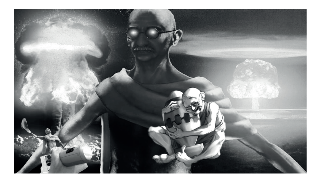
Figure 1. "Nuclear Gandhi" fans illustrations collage