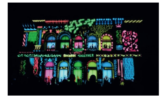
Figure 1. Video-mapping, Bacardi alcohol (Daniela Krautsack, 2011, online)