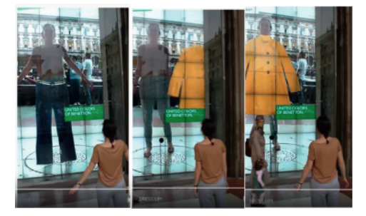
Figure 9. Interactive ambient marketing – bystanders are scanned and their visages are displayed dressed in Benetton collections (Benetton Windows Interaction, 2012, online)