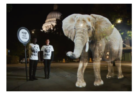
Figure 10. "WWF Elephant" Hologram. The elephant on the road, to raise awareness for animal trafficking (Watson Imogen, 2018, online)

In the aforementioned examples, augmented reality was partially independent from the concrete viewer (flying UFO in the streets or watching fish being added to an aquarium after a viewer's action). Augmented reality can be moved even further in communication and be enriched by an interactive aspect – a screen can react to a viewer directly, making him an inherent part of the production (Figure 9). Benetton firm's advertising reacts to concrete viewers, making them a part of the