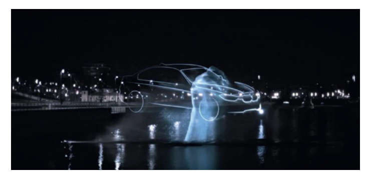
Figure 2. Water video-mapping, BMW car (JCDecaux, 2012, online)

The QR-code technology is connected to the mobile tagging practice, which is another form of mobile marketing communication that enables users to access more pre-generated, ideally exclusive content through their own personal devices. Not all of this content needs to be new, since the QR-codes could for example just be gateways to websites domains, in accordance with the aims of the marketer. One of the most spectacular examples of this practice was the first anniversary of the Chinese streaming service BiliBili, which celebrated conclusion of the first year of a popular video-game called Princess Connect Re: Dive by sending out more than 1500 drones, which formed a giant QR-code in the sky in Shanghai (Phillips, 2021) (Figure 4).