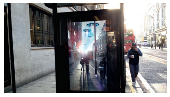
Figure 7. Augmented reality, bus stop, advert for Pesi Max (Jacob Kasternakes, 2014, online)

This kind of campaigns can also have an environmental aspect. An interactive digital project called No more fish in the sea? (Figure 8) can experience an immersive adventure into the underwater scenery right from their streets and they can watch their fish grow and reproduce just after they donate money to the project.