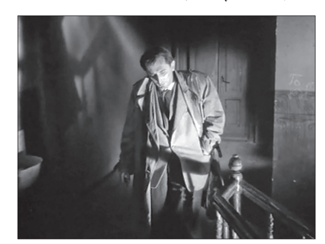
Il. 29–30. Pętla , dir. W.J. Has