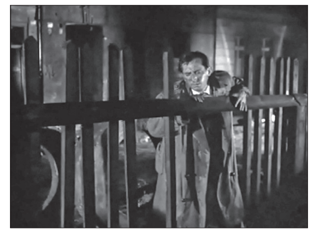
Il. 37-38. Pętla, dir. W.J. Has

[15] Ibidem, p. 322.[16] Ibidem, p. 335.