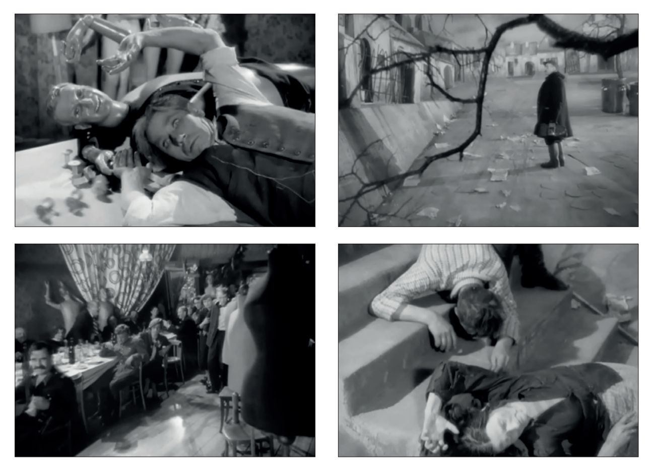
Il. 17–20. Zimowy zmierzch , dir. S. Lenartowicz

refer to the film space and the visual motifs known from avant garde films. The stylistics of oneiric sequences freely refers to various avant garde motifs: from surrealist (use of props and mannequins) and expressionist (painted scenery), to French (deformations of image) and Russian avant garde (a frame with victims beaten up by the police on the stairs; il. 17–20).