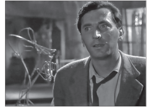
Il. 33-34. Pętla, dir. W.J. Has