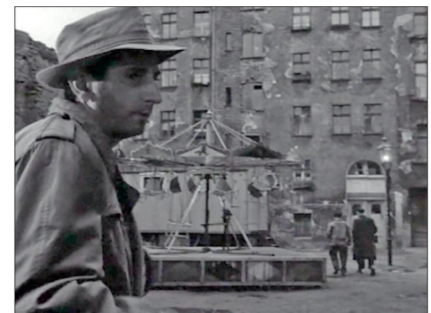
Il. 23-24. Pętla, dir. W.J. Has

Pętla was made as a black and white film, in a classical format (1:1,37). Mieczysław Jahoda managed to fully exploit the possibilities given by black and white film, first of all with – the contrast. Jahoda used the directed light falling – even during a single shot – from different directions at the same time, using lamps of different power and different width of the light stream. Sharp chiaroscuro outlines of the actors' faces, objects and elements of space predominates in the film (il. 25–26).