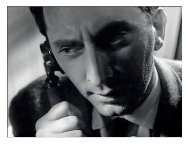
Il. 25–26. Pętla , dir. W.J. Has

Pętla was made as a black and white film, in a classical format (1:1,37). Mieczysław Jahoda managed to fully exploit the possibilities given by black and white film, first of all with – the contrast. Jahoda used the directed light falling – even during a single shot – from different directions at the same time, using lamps of different power and different width of the light stream. Sharp chiaroscuro outlines of the actors' faces, objects and elements of space predominates in the film (il. 25–26).