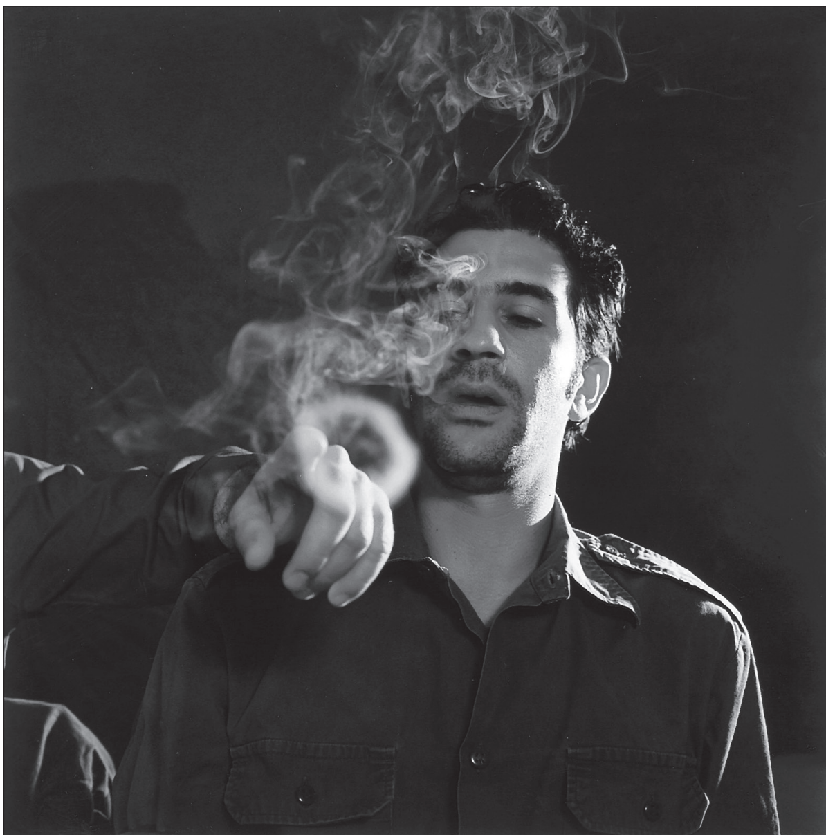
Adi Nes, Untitled (from the "Soldiers" series), 1994