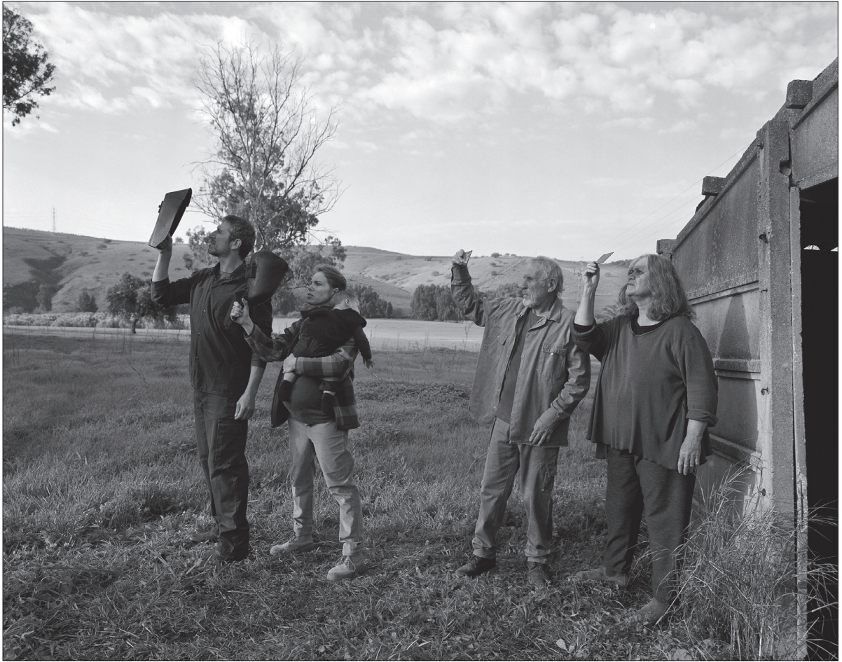
Adi Nes, Untitled (from the "Village" series), 2012