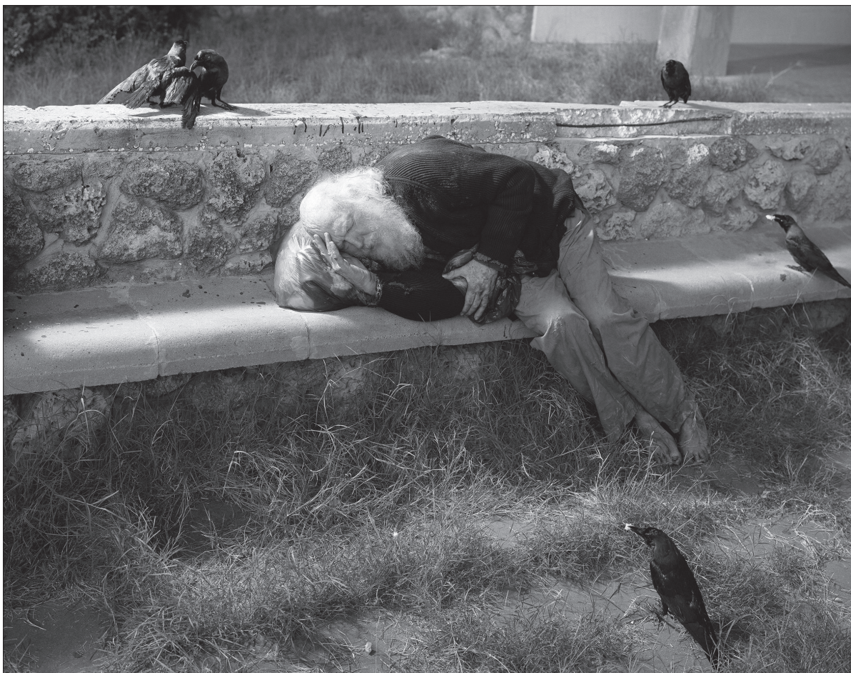
Adi Nes, Elijah (from the "Biblical Stories" series), 2006