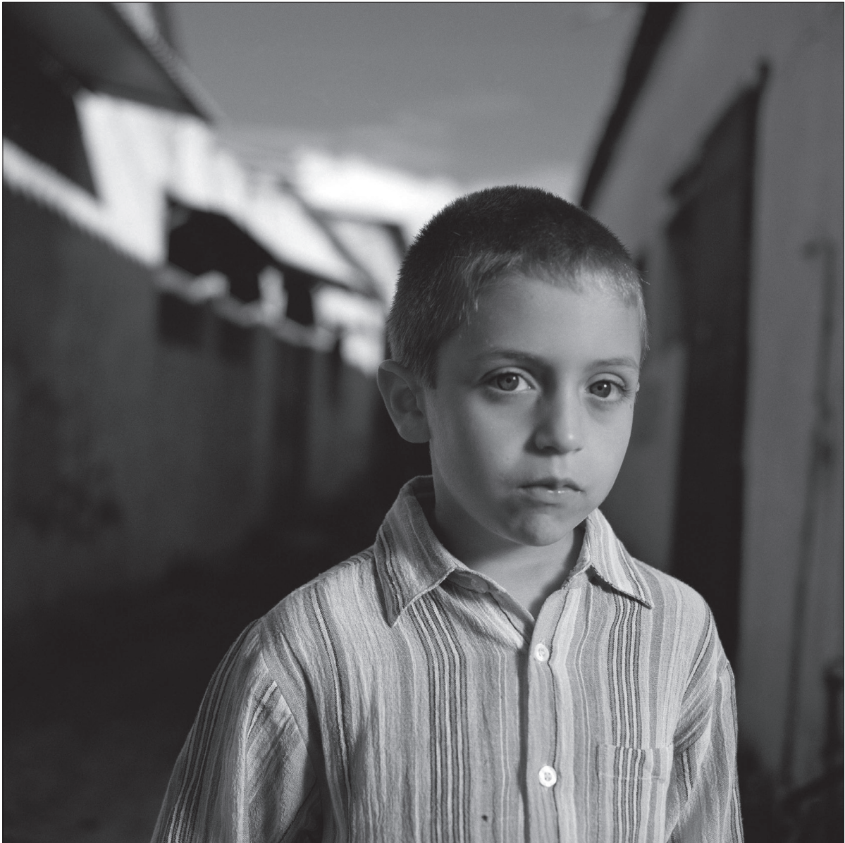
Adi Nes, Joseph (from the "Biblical Stories" series), 2006