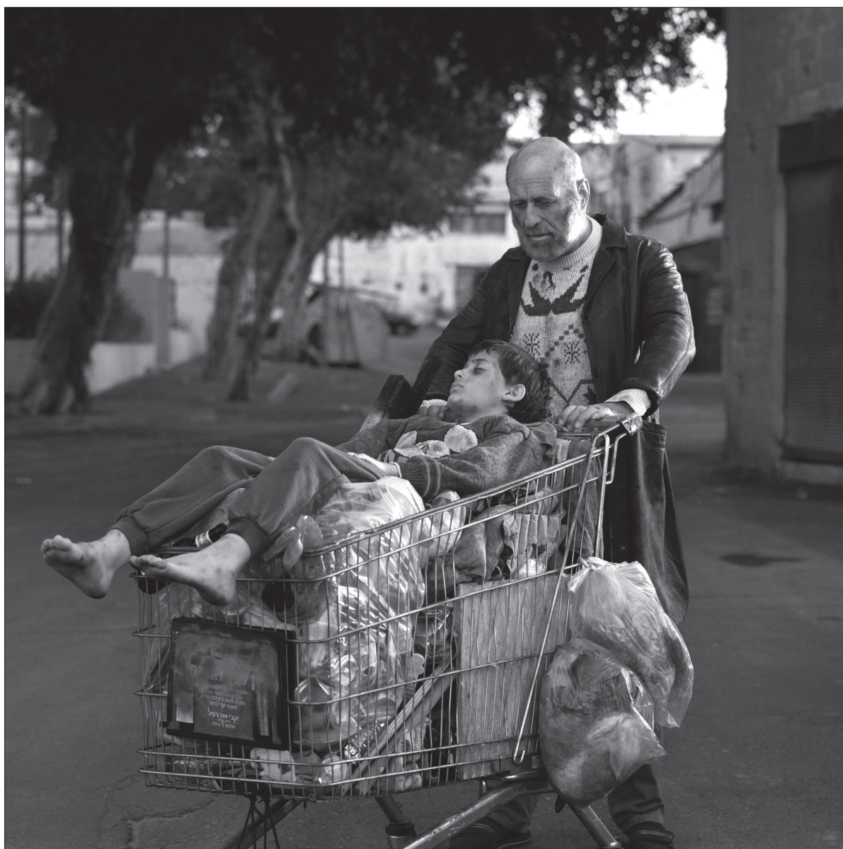
Adi Nes, Abraham and Isaac (from the "Biblical Stories" series), 2006