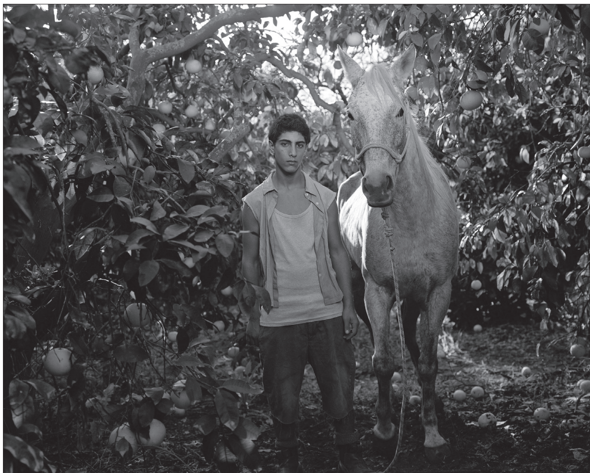
Adi Nes, Untitled (from the "Village" series), 2012