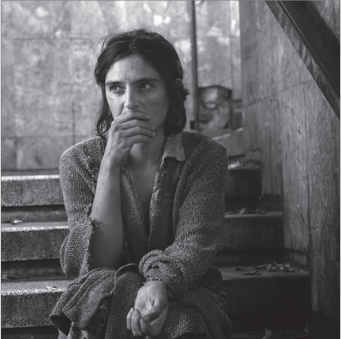
Adi Nes, Untitled (Hagar; from the "Biblical Stories" series), 2006