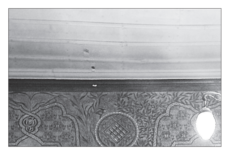
Fig. 5. 'Ades Synagogue, remnants of a starry-sky pattern (before the renovation of the synagogue paintings). Photograph: Zvi Orgad, 2013

trayed in early modern Hebrew texts and Jewish art.[<sup>26</sup>] However, whereas both sets of signs were depicted in the 'Ades synagogue, as I noted above, the zodiac signs were not reproduced in Ohel Moshe. As immigrants from Eastern Europe, Yaakov Stark and his colleagues at Bezalel were probably familiar with the zodiac motif, which was first documented in early modern synagogue paintings there.[<sup>27</sup>] In many of these synagogues, the zodiac signs were prominent pictorial el-