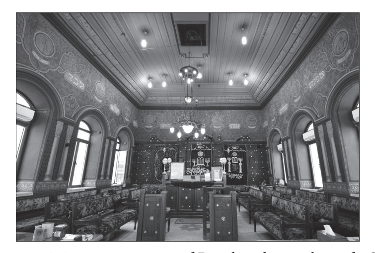
Fig. 1. 'Ades Synagogue, interior paintings (southern, eastern, and northern walls).

Yaakov Stark,[2] who combined two major styles in the paintings: Art Nouveau, which is mainly apparent in the design of the letters and borders, and an Orientalist style, which is manifest in the density of the vegetal decorations.[3] The interior paintings of the 'Ades Synagogue include depictions of the twelve signs of the zodiac, which are dominated by the symbols of the twelve tribes of Israel,[4] illustrations of the Temple menorah (the seven-branched candelabrum), the shield