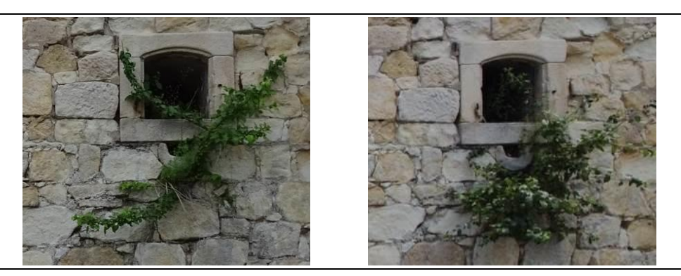
Fig. 8., Fig. 9. Proliferation of perennial rooted vegetation in the wall void below the damaged stone gargoyle. Deterioration of the joints around the gargoyle due to poor drainage of rainwater. Water runs directly down the face of the masonry

Fig. 6., Fig. 7. Surface damage to the stone blocks of the lintel of the casemate gate. Visible powdering of the stone surface, loss of historic joints