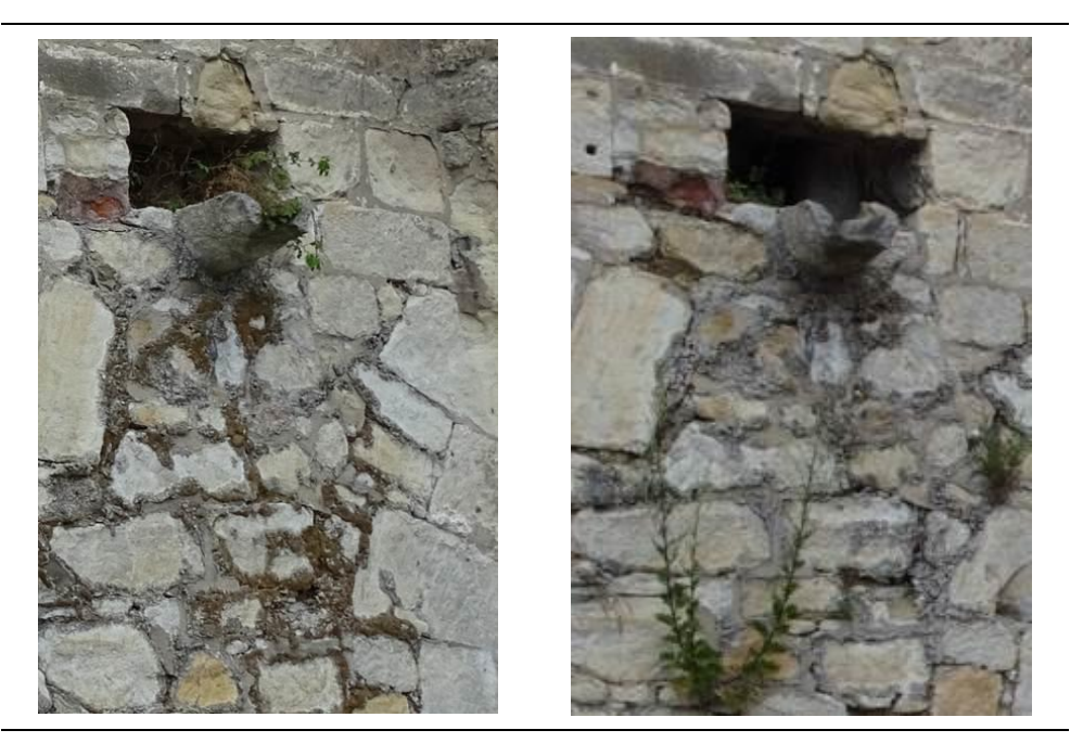
Fig. 12., Fig. 13. Biological corrosion of the limestone joints of the masonry face. The growth of moss and algae causes micro-damage to the mortar, creating a substrate on which annual and perennial vegetation can grow. This development intensifies the degradation processes