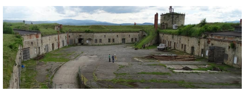
Fig. 22. Donjon's visual state for 2016.