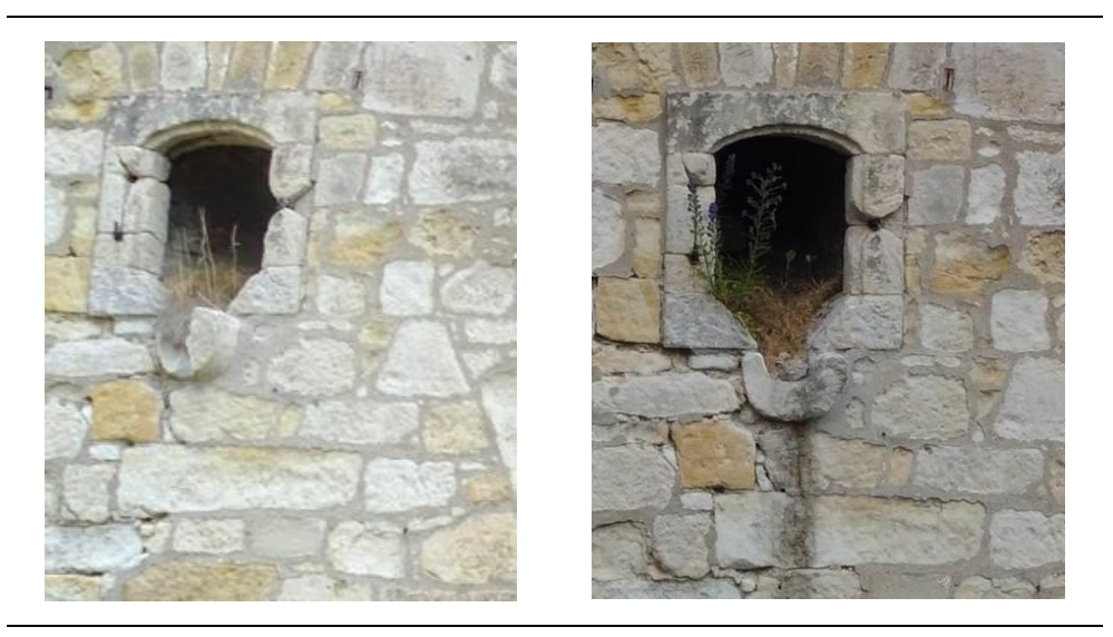
Fig. 16., Fig. 17. Vegetation growth inside the gargoyle. Inadequate drainage of rainwater results in streaking on the face of the wall. Damage to the stone face and joints from moisture, salt and frost corrosion is an additional problem

Fig. 14., Fig. 15. Changes in the condition of the masonry face due to salt and frost damage. Over a number of years, there has been increasing damage to the surface of the masonry and significant deterioration of the historic and secondary pointing of the masonry