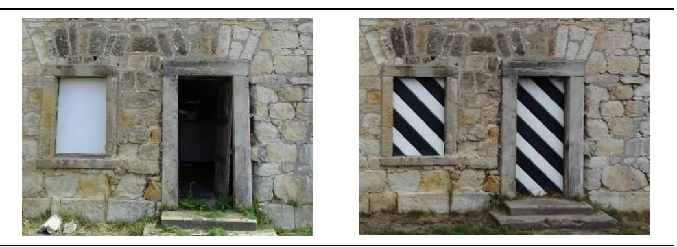
Fig. 18., Fig. 19. Replacement of the completely damaged entrance door and the panel in the window opening with new ones. Changes that significantly improve the aesthetics of the Donjon's façade