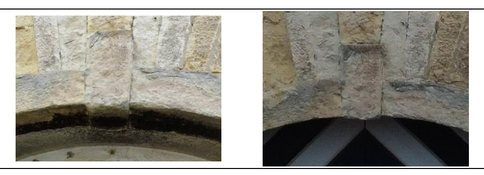
Fig. 6., Fig. 7. Surface damage to the stone blocks of the lintel of the casemate gate. Visible powdering of the stone surface, loss of historic joints

Fig. 4., Fig. 5. Progressive deterioration of the plaster and masonry of the clay brick superstructure. Damage to the upper layers of the stone façade due to salt and frost damage in areas of increased moisture. Deterioration of historic limestone masonry joints