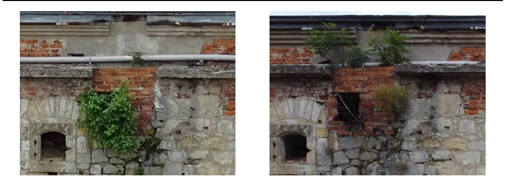
Fig. 10., Fig. 11. Further growth of weeds and young shrubs after removal of mature shrubs. Root systems of perennial vegetation cause degradation deep within the wall