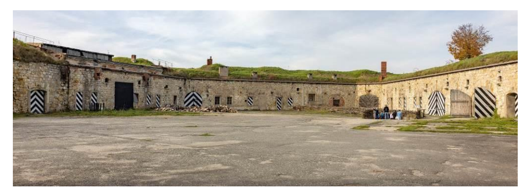
Fig. 23. Donjon's visual state for 2023.