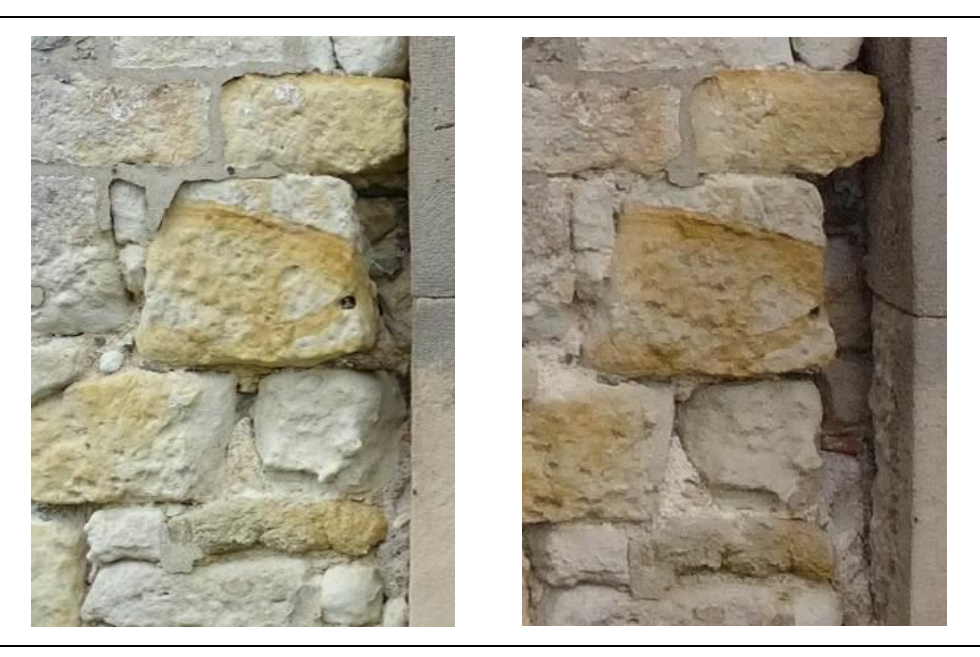
Fig. 14., Fig. 15. Changes in the condition of the masonry face due to salt and frost damage. Over a number of years, there has been increasing damage to the surface of the masonry and significant deterioration of the historic and secondary pointing of the masonry