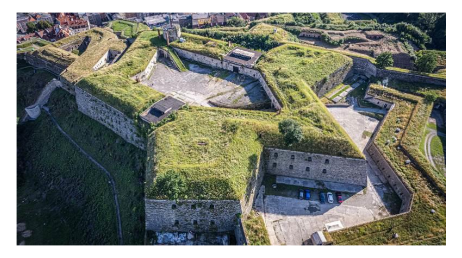
Fig. 1. Aerial photo of the Donjon at the Kłodzko Fortress, 2022.

The Fortress, located on a rocky hill (369 metres above sea level) dominating the town, known as the Castle or Fortress Hill, is one of Kłodzko's greatest tourist attractions [24]. It was designed to take maximum advantage of the natural terrain for defence. The fortress features a variety of architectural styles, as it has been continually expanded and modernised at various stages of its history to meet modern military standards. The massive walls, numerous bastions, caponiers, and mine channels make the fortress a fascinating place to explore and a testament to the evolution of defence techniques.