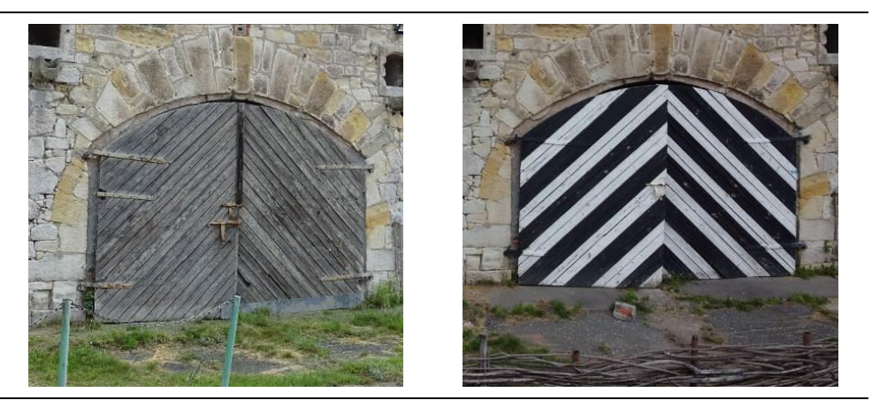
Fig. 20., Fig. 21. Renovation of the gate leading to the casemate, repainted in the original style. Removal of the metal chain-link fence and its replacement with a low wooden fence