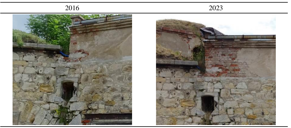
Fig. 4., Fig. 5. Progressive deterioration of the plaster and masonry of the clay brick superstructure. Damage to the upper layers of the stone façade due to salt and frost damage in areas of increased moisture. Deterioration of historic limestone masonry joints

Table 1. A compilation of the most characteristic damage to the Donjon façade at Kłodzko Fortress based on the 2016 and 2023 surveys, along with their description. Source: own study