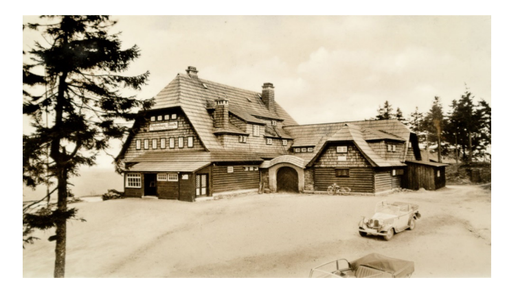
Fig. 6. Zieleniec. Hindenburgbaude shelter. North-west façade. The interwar period.