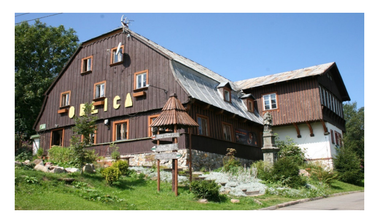
Fig. 4. Orlica shelter in Zieleniec, built in 1878. The building with log walls, covered from the outside with vertically-laid boards and with a mansard roof with dormers, also has an attic storeroom in the form of an extension, supported by the masonry walls of the ground floor. There was a second tavern near Orlica (Gasthaus zur Mense), of a similar shape and structure, but it was pulled down in the 1960s. Photo by Jacek Suchodolski 2009