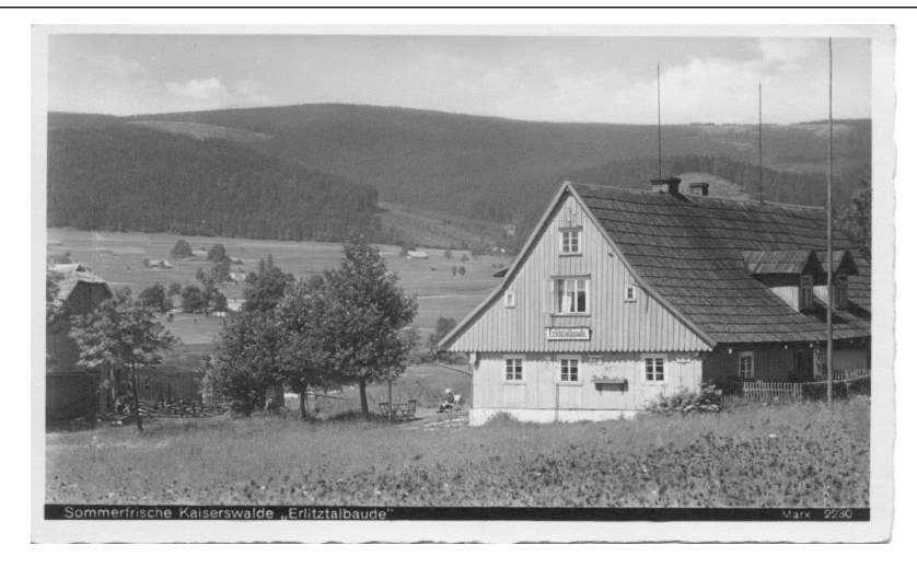
Fig. 12. Lasówka (Kaiserswalde), Erlitztalbaude shelter, the interwar period.