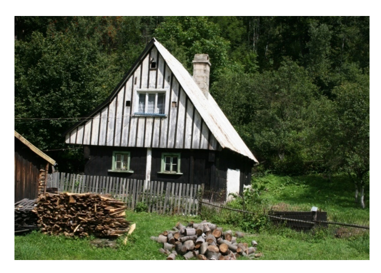
Fig. 2. The village of Młoty in the Bystrzyckie Mountains. A rural residential building with log walls, a gabled roof covered with sheet metal, with a slope of 45 degrees.