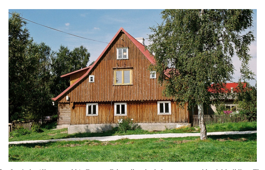
Fig. 13. Lasówka ( Kaiserswalde ). Former Erlitztalbaude shelter, now a residential building. The metal sheet on the roof was nailed to the original shingle covering through ridge beams.

The second shelter, Erlitztalbaude (Fig. 11, 12), located near the Mostowy Stream, which also has a classic, regional form, has survived to our times, becoming a residential building after 1945. Initially, it housed the Stumpfgasthaus inn, and in the 1930s it became a shelter. A characteristic element in the body of the building is the raised roof slope ( Frakdach ), intended to provide larger cubic capacity in the attic. This was often used in facilities intended for tourist and leisure purposes. This building – like the previous one – represents one of the varieties of the local regional architecture, whose main features