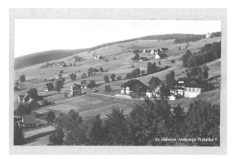
Fig. 10. Zieleniec. In the foreground, on the right, the Grunwaldbaude shelter, later known as Adlerbaude. A characteristic element in the body of the shelter was the observation porch. The interwar period.

Mensehorst am goldenen Stollen youth hostel, located about two kilometres from Zieleniec, by the Orlicka Road, was built in 1927 as a small one-storey building with a steep gable roof (Fig. 8A). It had 23 rooms with 40 beds. In 1936, a second, also one-storey building (Fig. 8B) was erected on the plot of the existing facility, with architecture reminiscent with its form of border guard buildings in many Sudeten towns along the border (e.g. in Szklarska Poręba, on the Okraj Pass, in Jarkowice, Pasterka, Zieleniec, Lasówka, Rudawa, Lesica, Międzylesie). In the 1960s, Mensehorst am Goldenen Stollen was demolished.