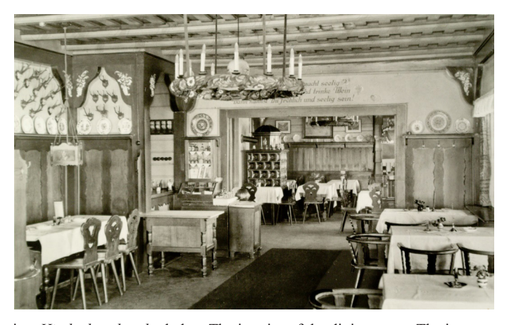
Fig. 7. Zieleniec. Hindenburgbaude shelter. The interior of the dining room. The interwar period.