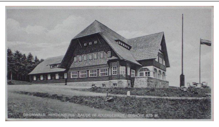
Fig. 5. Zieleniec ( Grunwald ). Hindenburgbaude shelter. North-east façade. The interwar period.