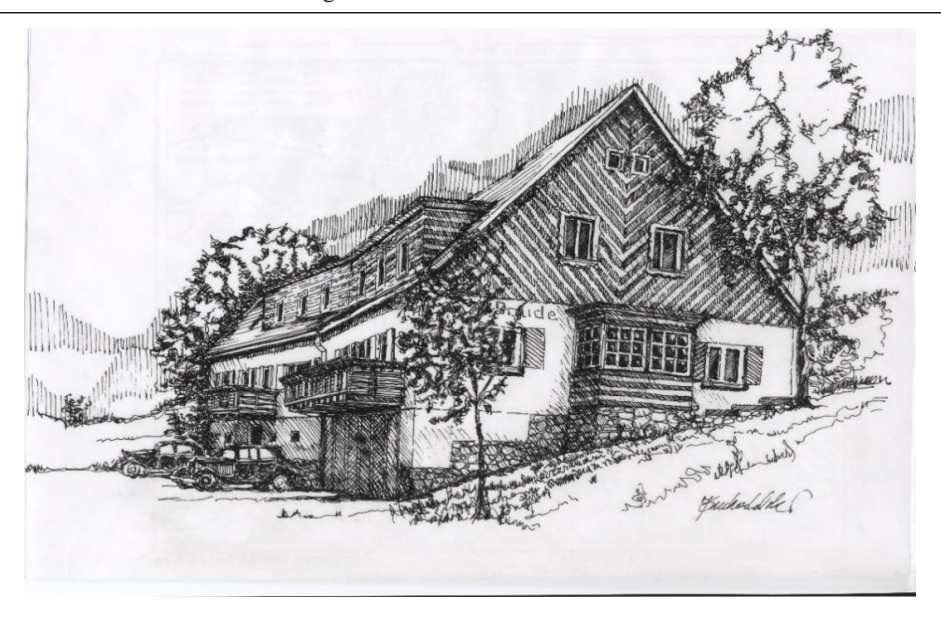
Fig. 14. The Puchaczówka Pass (899 m above sea level) separating the Śnieżnik Mountains from the Krowiarki Mountains. The Puhu-Baude shelter, the interwar period. Drawing by Jacek Suchodolski [17]

Along with the change of the inn into a shelter, it was expanded and its architecture was given a regional form. It had 17 beds in 14 rooms and a shared room. The wooden-brick building gained a compact body with a steep, gable roof with a long dormer. The gable walls were covered with boards arranged in a herringbone pattern, and the ground floor windows were fitted with shutters, which clearly referred to regional motifs. The interior of the shelter was in a rustic style, which was emphasised by the beam structure of the wooden ceiling. Similarly, tables and chairs were made of wood, and it was all complemented by a large tiled stove. White areas between the ceiling beams were covered with floral motifs. Porcelain plates decorated with local motifs hung on the walls, and under the ceiling there was a wooden candelabrum depicting a group of musicians, reminiscent in its form of the works of woodcarvers from the Cieplice school of crafts<sup>2</sup>. This shelter, which was very popular before the war, ceased to exist after 1945. Near Puhu-Baude, another small shelter was built in the interwar years - Schwarze-Berg-Häusel (900 m above sea level), located on the slope of Czarna Góra. An alpine garden was founded around it, the remains of which are still visible today. The building was crowned with a characteristic steep gable roof, giving it a somewhat "fairy-tale" character. Like the neighbouring shelter, Domek Czarnogórski was pulled down after 1945