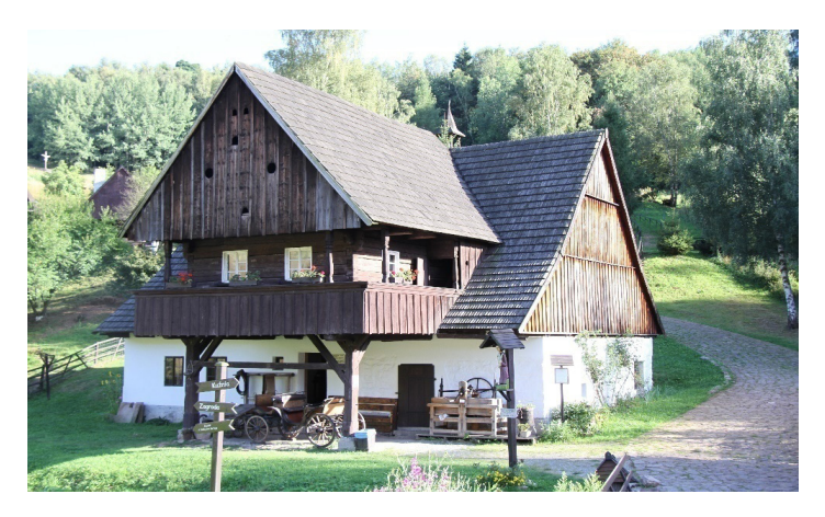
Fig. 3. Pstrażna – an open-air museum of wooden buildings. The so-called Zajazd (Inn) moved from Szalejów Dolny (probably built in the first half of the nineteenth century). The modest form of a single-storey house with log walls is diversified by an attic storeroom, i.e. an extension protruding beyond the eaves, supported on posts, in which there were rooms for tourists. Photo by Jacek Suchodolski 2015

Buildings in the region had gable roofs or roofs with a mansard structure. Buildings with log walls and mansard roofs are also a distinctive group among wooden architecture. Larger in volume, they often had the above-mentioned attic storerooms and served as taverns, shelters and inns. These roofs were mostly covered with diamond-shaped eternit or sheet metal tiles (Fig. 4).