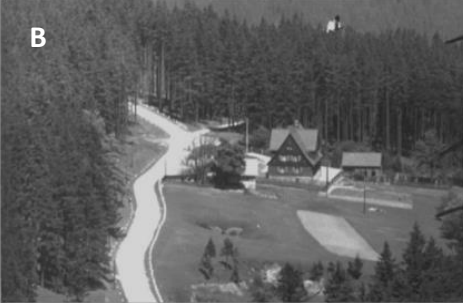
Fig. 9. Mensehorst am Goldenen Stollen shelter: (A) – the first building from 1927, (B) the shelter after its expansion (after 1936).

Mensehorst am goldenen Stollen youth hostel, located about two kilometres from Zieleniec, by the Orlicka Road, was built in 1927 as a small one-storey building with a steep gable roof (Fig. 8A). It had 23 rooms with 40 beds. In 1936, a second, also one-storey building (Fig. 8B) was erected on the plot of the existing facility, with architecture reminiscent with its form of border guard buildings in many Sudeten towns along the border (e.g. in Szklarska Poręba, on the Okraj Pass, in Jarkowice, Pasterka, Zieleniec, Lasówka, Rudawa, Lesica, Międzylesie). In the 1960s, Mensehorst am Goldenen Stollen was demolished.