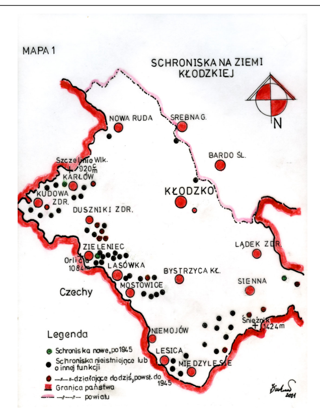
Fig. 1. Location of shelters in Kłodzko Land (points: green – new shelters, built after 1945; black – non-existent shelters, shelters that perform a different function; red – shelters in operation today, built after 1945; lines: red – Polish and Czechia state border; rose – poviat (district) border). Author's study