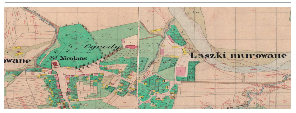
Fig. 2. Cadastre map of the town Liashky Murovani, 1853. Fragment

Historical references to the existence of a town with a market square in the area around the castle, owned by the Mniszech family, date back to the 16<sup>th</sup> century. There is also evidence that this town had been granted the Magdeburg rights [3].