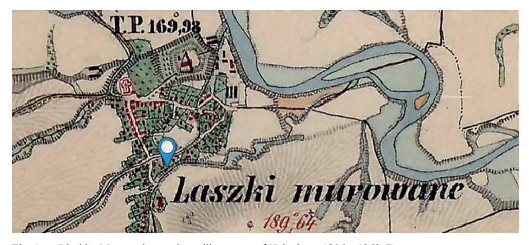
Fig. 1. Liashky Murovani. Austrian military map of Halychyna 1806 – 1869. Fragment

This paper presents the historical town of Lyashky Murovani, which is one of the most valuable town-planning objects in the Ukraine. The town stands out because of its unique urban structure of the 17<sup>th</sup> and 18<sup>th</sup> centuries, and today is now known as Murovane Village, located in the Staryi Sambir district, in the Lviv region, on the Khyriv – Staryi Sambir route. The urban composition originally consisted of a castle-palace ensemble with a large-scale park, a market square framed with buildings, sacral structures, and probably fortifications (Fig. 1, 2).