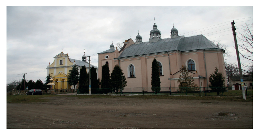
Fig. 6. Views at the historical churches in the village Murovane. Picture took by the authors in 2018

A series of field surveys and fixations of the preserved elements of the historical urban planning of 17th -18th century was made during the research. The basic identifying elements are: the existence of the valuable elements of the historic castle and palace complex, the Church of the Immaculate Conception and St. Martyr George (mid-18th century), and St. Joseph the Betrothed Church (late 18th century) (Fig. 6), fragments of the historical park, the elements of residential buildings, streets, and squares.