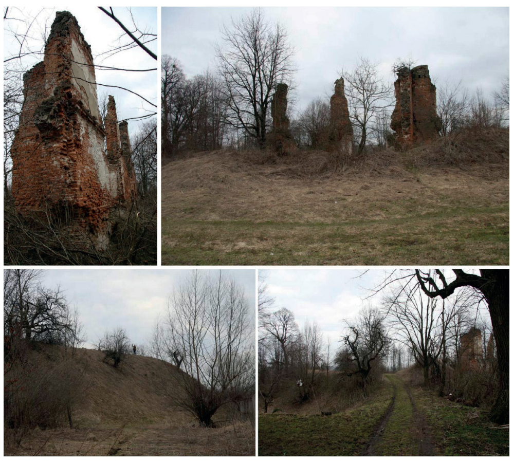
Fig. 4. Views of the relics of the former historical palace complex in the village Murovane.

By 2018, only several small fragments of the palace walls were preserved, historical ramparts can also be identified from the relief. Unfortunately, the park area had been badly damaged over the centuries (Fig. 4). The structure of the village retained the historical market square, buildings framing the space, and historical parcels (Fig. 5).