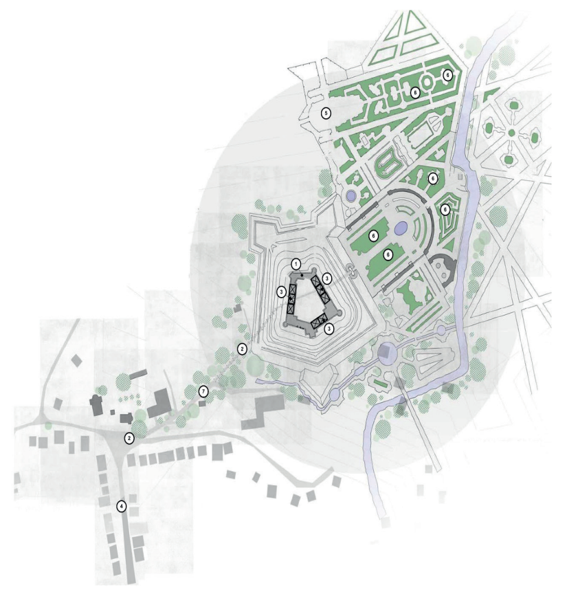
Fig. 8. The scheme representing the list of actions aimed at reproduction of the historical town Liashky Murovani. Authors; Z. Lukomska, H. Lukomska

The implementation of the proposed monument protection measures will allow: investigation into the existing technical condition of the historical urban object, elimination of the negative factors that cause the destruction of cultural heritage objects; an increase in the value of the preserved historical buildings by involving them in public life; preservation of the unique historical and urban planning environment and adapt it to modern needs of the society; to mark and partly recreate the lost unique palace and park complex; to convey the historical aspects of the region development to the residents and visitors of the historical city and to begin the process of grounding the proper attitude to the monuments of architecture and history; activation of the development of tourism as one of the main factors for the promotion of Ukrainian urban heritage.