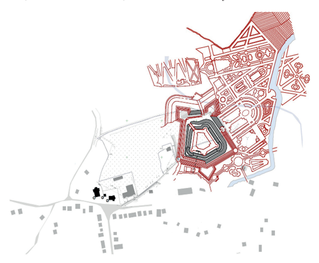
Fig. 7. The scheme of the theoretical reconstruction of the planning structure of the historical town Liashky Murovani. Notice: missing elements are marked with the red color. Author: I. Shevchuk

periods 1764 – 1784 and 1806 – 1869 [9, 10], the plan of the castle, town, and garden in Lyashky Murovani 1734 [6], a topo-geodetic survey of the village park in the village of Murovane 2016; historical narrative materials; the current fixation of the object.