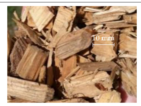
Fig. 1. Beech wood sawdust.

The available literature does not specify which types of wood are used to obtain sawdust with the best results as a material for the production of sawdust concrete. The available research shows use of chips from – for example – juniper, beech (Fig. 1), spruce, pine, fir and padauk trees [1], [3], [8]-[11]. Authors of mentioned papers used local species obtained from nearby sawmills and other wood processing centres.