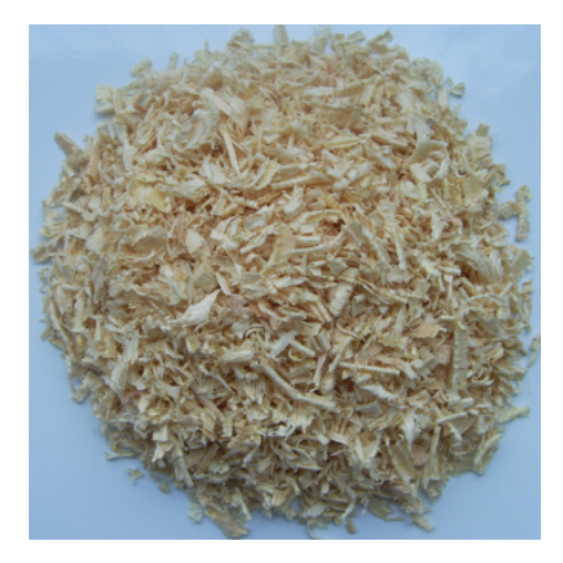
Fig. 2. Fine sawdust.

The available literature does not specify which types of wood are used to obtain sawdust with the best results as a material for the production of sawdust concrete. The available research shows use of chips from – for example – juniper, beech (Fig. 1), spruce, pine, fir and padauk trees [1], [3], [8]-[11]. Authors of mentioned papers used local species obtained from nearby sawmills and other wood processing centres.