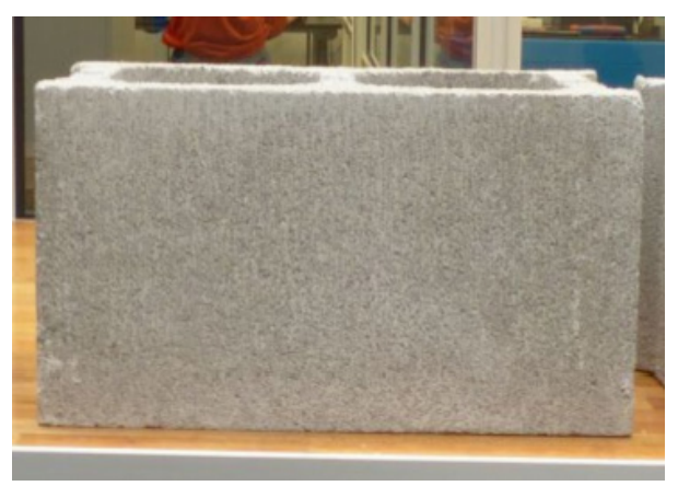
Fig. 3. Sawdust concrete block with 5% fine sawdust.

Portland cement plays the role of a binder [14]. It is possible to add additives and admixtures to sawdust concrete. As a result of the combination of wood and concrete, a material with a lower density and greater thermal and acoustic insulation than regular concrete is obtained [13], [15].