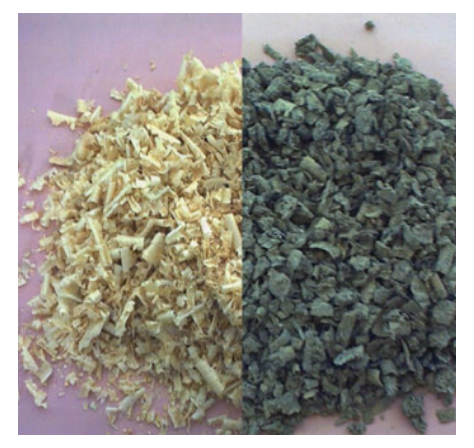
Fig. 4. Fine sawdust before (left) and after (right) drenching it in a protective mixture made of cement and water. Source: [3]

Chips used for production of sawdust concrete need to be mineralized. Calcium chloride is used for this purpose – thanks to the supersaturation of natural wooden aggregate, it is protected against quick deterioration [13]. Chromated copper arsenate (CCA) is another substance used to protect sawdust [11]. Some sources suggest treating sawdust with broadly understood alkali [5]. Another approach proposed by some researchers is, in order to improve the adhesion between the cement and sawdust, placing the chips in a sodium silicate solution (100g/11) 24 hours before mixing with other sawdust concrete components [9]. Also, protection of sawdust by prior coating it in a water-cement mixture (Fig. 4) in the cementto-wood mass ratio of 2.5, results in increased strength and reduced shrinkage when setting concrete [3].