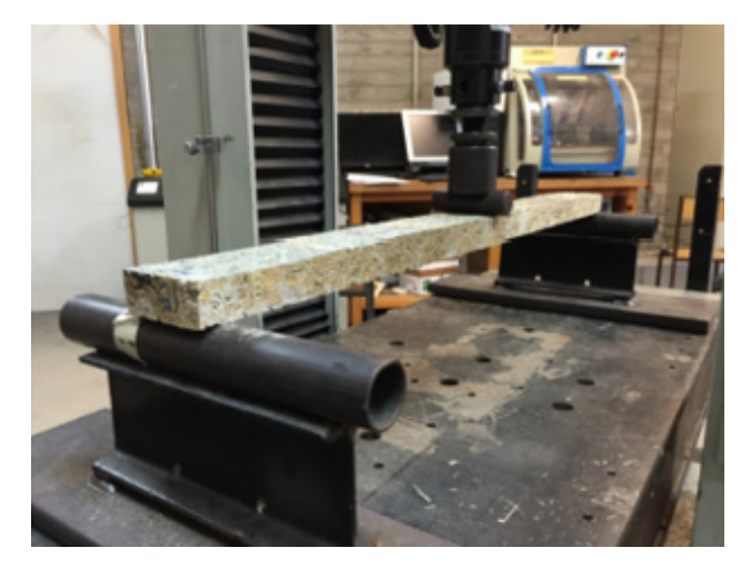
Fig. 6. Bending test of a simply supported beam made of sawdust concrete. Source: [1]

It is possible to compare the obtained values to those given for concrete according to PN-EN-1992. Depending on the class of concrete, the characteristic cube compressive strength ranges from 15 to 60 MPa, therefore some values obtained for sawdust concrete fall within this range. The obtained values of Young's modulus for sawdust concrete are much lower than the European standards for concrete, for which, depending on the class, the modulus of elasticity ranges from 27 to 37 GPa. However, it should be noted that for sand aggregates, which were partially used in the tested sawdust concrete, the Young's modulus of concrete decreases by 30%, which gives the range of 18.9 - 25.9 GPa, which already includes some of the results obtained for sawdust concrete.