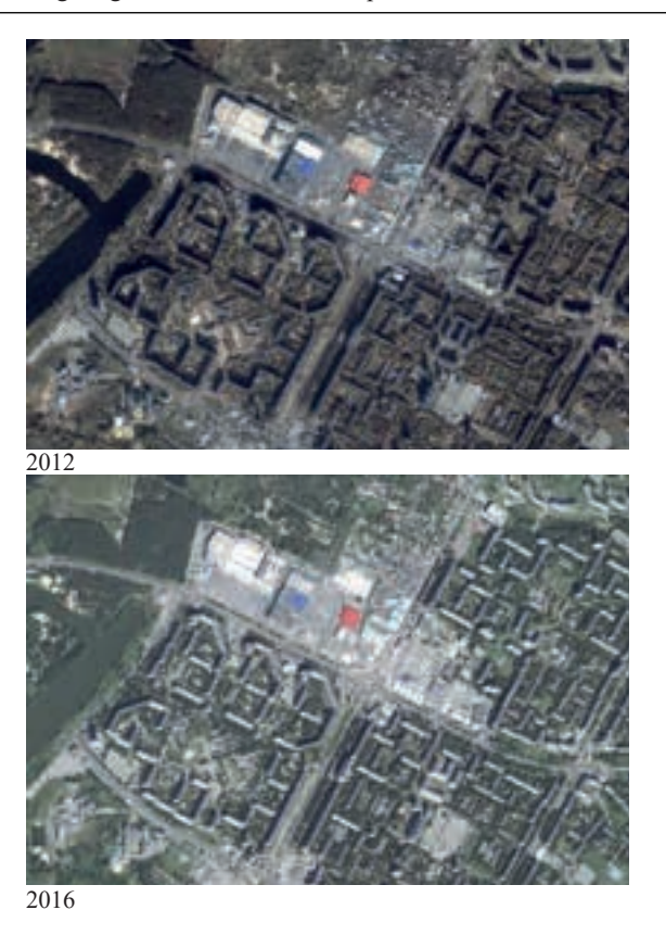
Fig. 1. The residential area around the node with metro station Heroyiv Pratsi, Saltivka, Kharkiv. 2000, 2008, 2012, 2016 [Google Earth Pro; retrieved in 2017].

The large-scale changes in the case study area around the node near the south part of residential area Saltivka include metro station Barabashovo and a large market area Barabashovo. The retail trade function started to develop in 1995 here as open-air market with containers for retail trade and trade rows. During the last 22 years it spreaded to the territory of 75 hectares and became one of the biggest retail markets in the Eastern Europe. The growth did not have any adopted or proved development plan and was directed by the group of directors of the market, which received the positive solutions from the authorities. The traders in the market area Barabashovo were informal dealers and small entrepreneurs. The chaotic structure of the market does not fulfil the norms and standards for planning and development of market areas, as: norms of emergency and evacuation, insolation, ventilations, sanitation, sewerage. For instance, these lead to the fact that one of the entrances to the metro station by Academic Barabashov is tightly surrounded by the trade rows and makes it difficult for the ordinary inhabitant to find easily the right direction where the entrance to the metro is situated.