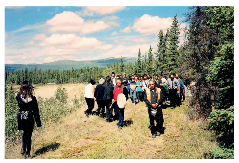
Fig. 6. The procession to the burial site at Steamboatlanding.

Next was the procession to the burial site at Steamboatlanding, about eighty kilometers from Whitehorse. The coffin was carried to the burial site. Note the drummer and Elder in front of the procession.