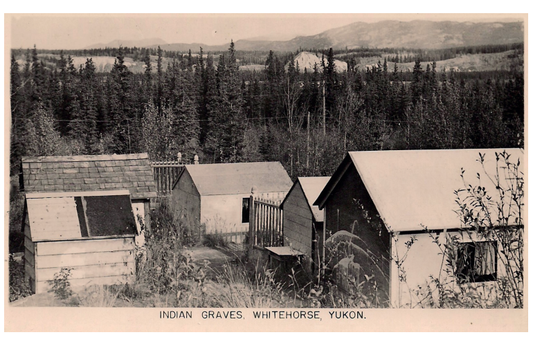
Fig. 7. Postcard