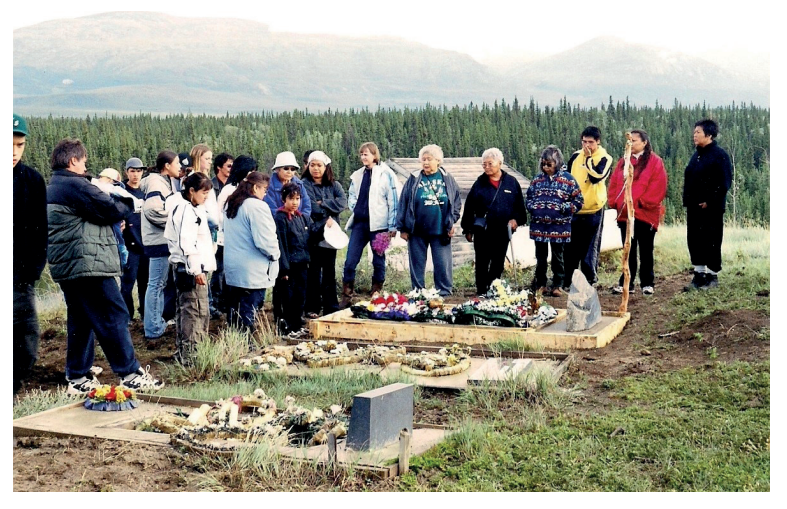
Fig. 6. The head stone potlatch

The next photograph is a year later and this potlatch is called the headstone potlatch. This is when the headstone is placed at the grave. Note the grave house behind the people which is from an earlier burial and two earlier graves of my older brother and stepfather in the front. A fence is planned to be placed around the three graves.