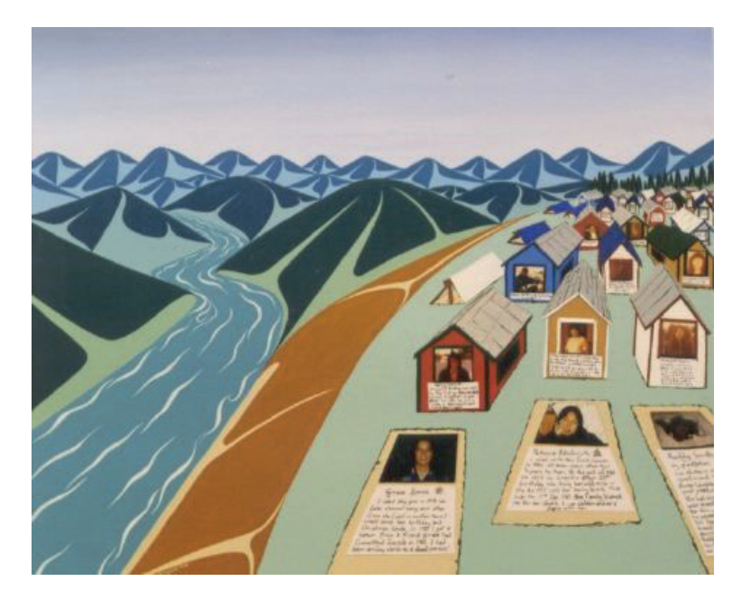
Sacred Spaces In North America

As in western art, that of First Nations artists often reflects society and the images I create are the reflection of the society I am living in. Some deal with our high death rate, some deal with our place in the modern world and the injustices I see and some are my efforts to raise awareness to our almost-lost older art practices. In this painting below titled Yukon Reality illustrates our high death rate. The grave houses go off into the distance seemly to never end. In the grave houses are photographs of my family members, classmates, buddies and former girlfriends who have all died. I write a bit about each person in the space below the photograph. The grave houses are balanced by the beauty of the Yukon wilderness on the left side. While the social situation for Yukon First Nations has changed dramatically, the land remains majestic.