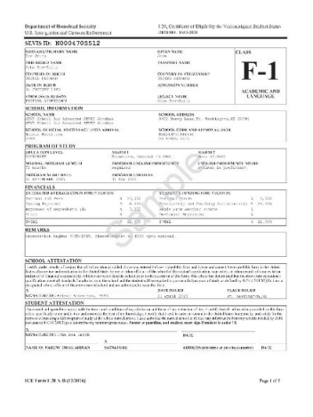
A sample of the I 20 document