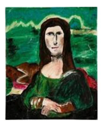
Fig. 4. Andrea Schmidt, Mona Lisa Vancouver (CA), 12" × 16", oil on canvas, 2002 http://museumofbadart.org/

The museum's success, especially in the media, allowed the collection's expansion, which currently has more than six hundred pieces subdivided by themes. Often the categories make use of ironic puns best to convey the spirit of the museum and the collection; for example, portraits are transformed into 'Poor Traits.'