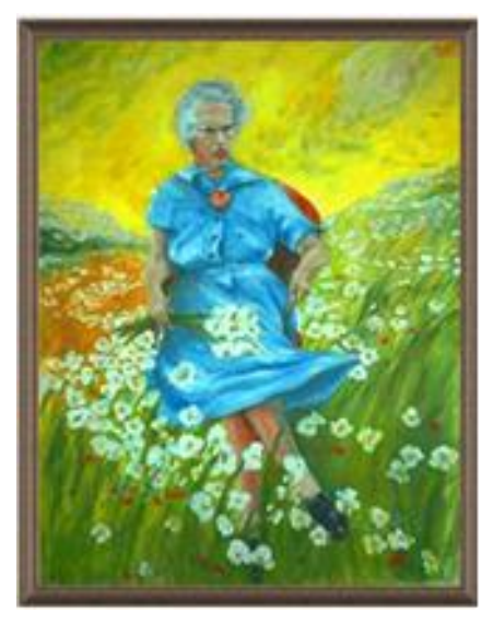
Fig. 3. Anonymus, Lucy in the Field with Flowers 24" × 30", oil on canvas, 1993 http://museumofbadart.org/

MOBA) is a community-based and non-profit museum which, since 1993, collects, exhibits, and preserves all forms of Bad Art, i.e., works of art that according to traditional aesthetic standards would never be part of a regular museum collection.