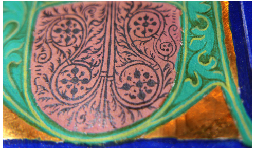
Figure 8. Żarnowiec, Muzeum Opactwa Mniszek Benedyktynek, L4, gradual: (a) fragment of decoration on f. 4v, (b) detail of the E(t) initial on f. 42v.