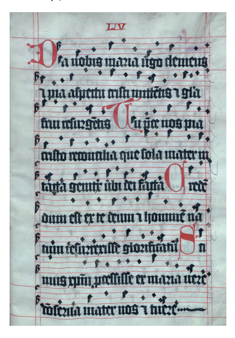
Figure 14. Gdańsk, Polska Akademia Nauk – Biblioteka Gdańska, Mar. F 406, f. 55r.