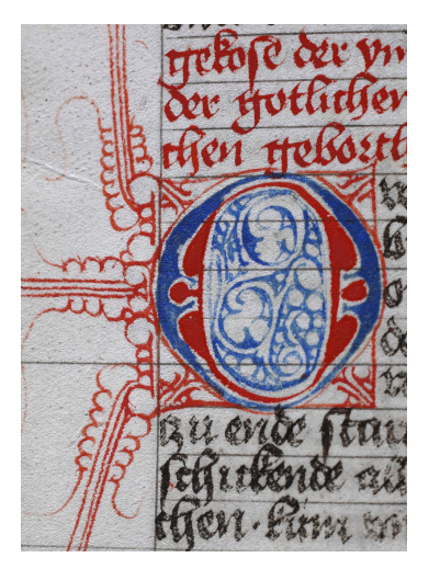
Figure 9. Examples of pen-flourished initials by the illuminator of Mar. F 406: (a) Gdańsk, Polska Akademia Nauk – Biblioteka Gdańska, Mar. F 59, (b) Toruń, Biblioteka Uniwersytecka, BUMK 41/ III, (c) Toruń, Biblioteka Uniwersytecka, BUMK 2/III.