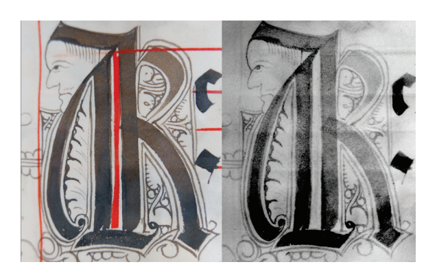
Figure 4. Gdańsk, Polska Akademia Nauk – Biblioteka Gdańska, Mar. F 406, a cadel with the mask motif: (a) in visible light, (b) in near-infrared (NIR), visible marks of the ink being drawn upwards along the contour.