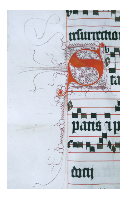
Figure 12. Żarnowiec, Muzeum Opactwa Mniszek Benedyktynek, L1, gradual, a sample pen-flourished initial.