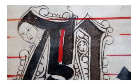
Figure 11. Gdańsk, Polska Akademia Nauk – Biblioteka Gdańska, Mar. F 406, a cadel with penflourishing and a girl's mask.