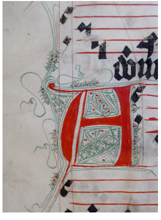
Figure 13. Gdańsk, Polska Akademia Nauk – Biblioteka Gdańska, Mar. F 406, (a) the text on f. 24r, (b–c) pen-flourished initials, visible un-erased, uneven line of the initial's field and untidy stave-lines.