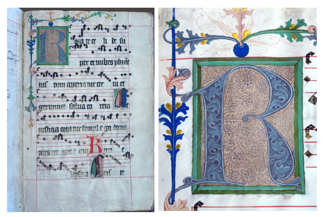
Figure 6. Gdańsk, Polska Akademia Nauk – Biblioteka Gdańska, Mar. F 406, the incipit page (f. 1r) decorated in gouache: (a) general view, (b) the R(orate) initial.