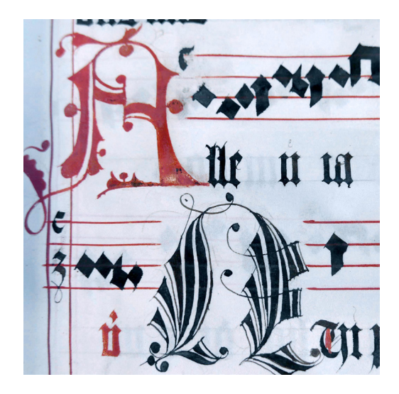
Figure 16. Gdańsk, Polska Akademia Nauk – Biblioteka Gdańska, Mar. F 406, initials on f. 67r.