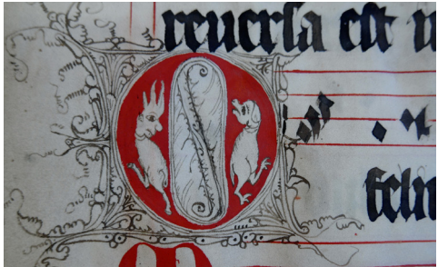
Figure 15. Gdańsk, Polska Akademia Nauk – Biblioteka Gdańska, Mar. F 406, pen-flourished initials: (a) f. 48r, (b) f. 48v.