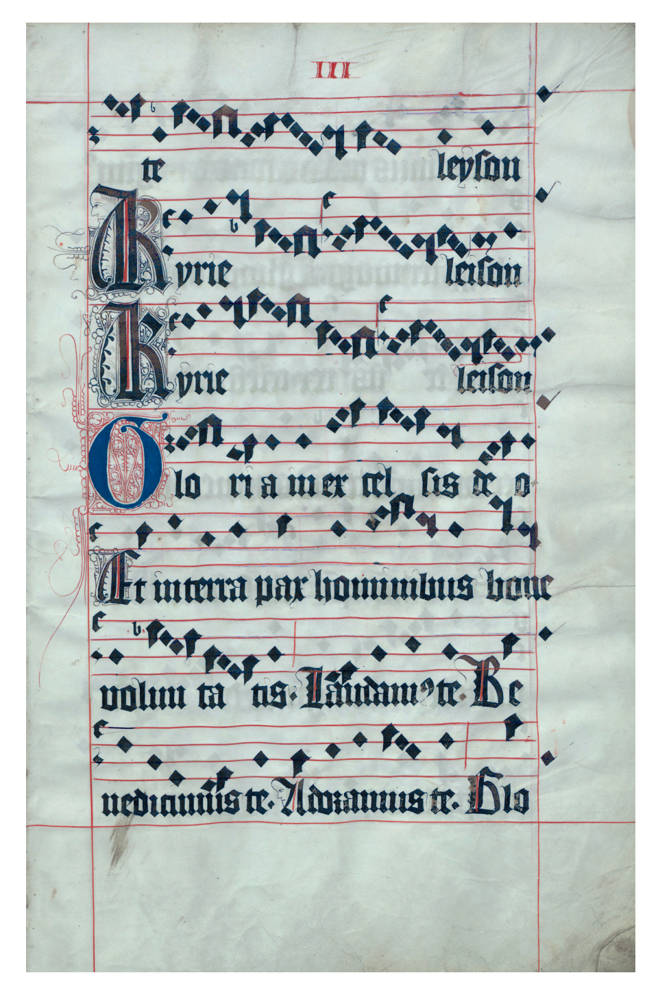
Figure 2. Gdańsk, Polska Akademia Nauk – Biblioteka Gdańska, Mar. F 406, f. 3r.