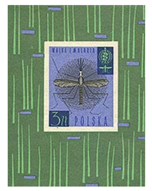
Fi 1201, BI.35